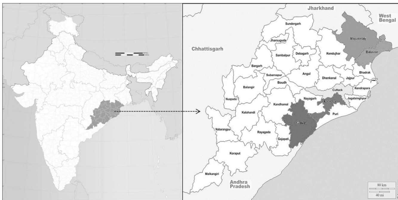
Figure 1: Location of the districts where the project was initiated

The following results were obtained over the 3 years (July 2016–June 2019).