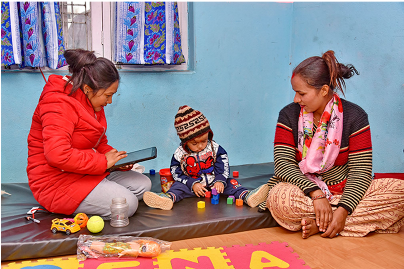
Fig. 1 Child in the EN-SMILING study with their mother and a primary care assessor trained in child development

venting morbidly, addressing maternal mental health) and for adolescents (transition to healthy behaviours, optimal education). Nutritional outcomes in children often require intergenerational improvement for girls and women (Budhathoki et al. 2019a, b). Optimal child development is strongly associated with nutritional status and can be two-way, since children with disability are especially at risk of failing to thrive. Nepal is also