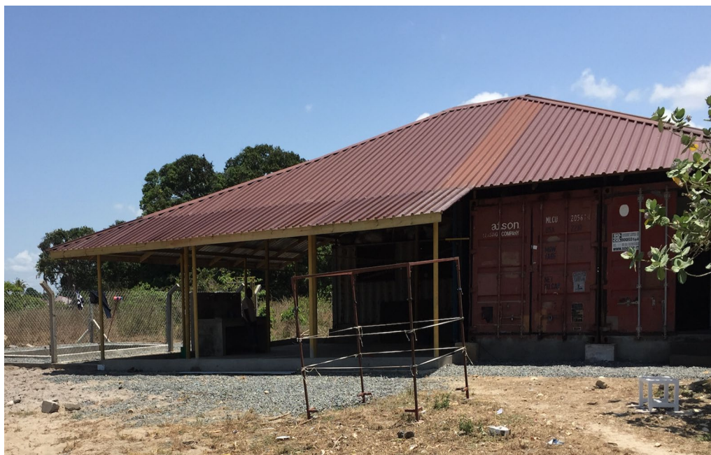
Fig. 1 The Bagamoyo IHI LLIN storage facility

Eight LLINs (four nets of each brand) were randomly selected from the same product batch. LLINs were coded, cut into pieces (25 cm × 25 cm) and washed one, three, five, ten, 15 and 20 times following WHO standard procedures for laboratory testing (phase I) [8] The washing