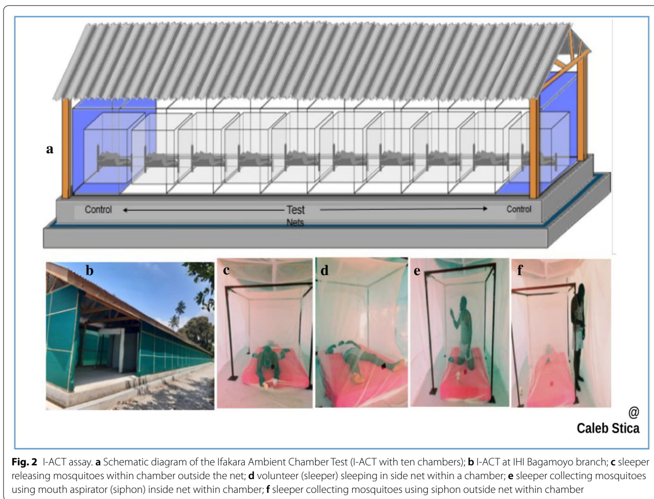
Fig. 2 I-ACT assay. a Schematic diagram of the Ifakara Ambient Chamber Test (I-ACT with ten chambers); b I-ACT at IHI Bagamoyo branch; c sleeper releasing mosquitoes within chamber outside the net; d volunteer (sleeper) sleeping in side net within a chamber; e sleeper collecting mosquitoes using mouth aspirator (siphon) inside net within chamber; f sleeper collecting mosquitoes using siphon outside net within chamber

24-h, the proportion of mosquitoes in each of the four categories was again scored using the above criteria. Following each night of the experiment, test nets were repacked in their respective bags, chambers were cleaned and bed sheets were washed to prevent contamination. LLINs remained fixed to their respective chambers while sleeper volunteers rotated nightly for ten experimental nights so that each volunteer tested each net type once. This was done to account for difference between human attractiveness to mosquitoes that might affect the proportion of mosquitoes blood feeding. Acceptable mortality was \leq 10\% or \geq 50\% blood-feeding success in control [8] (Table 1, Fig. 2).