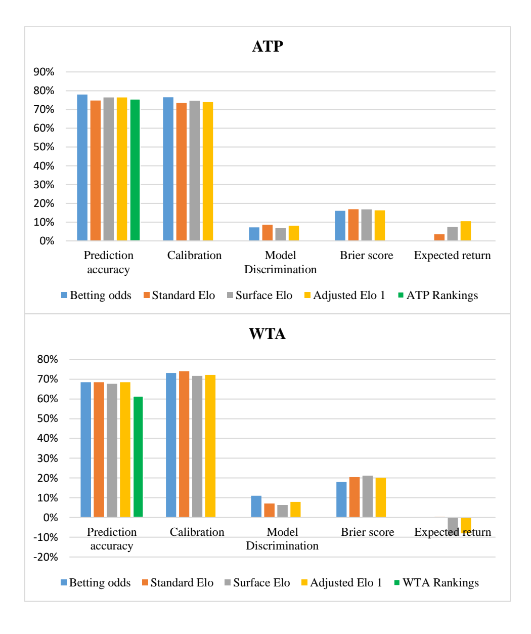
Table 13 summarizes the prediction by an adjusted Elo rating using Elo and surface Elo for 2019 French Open. For both ATP and WTA, this adjusted Elo rating performs the best in terms of model discrimination and expected return in ATP, and prediction accuracy and calibration in WTA.