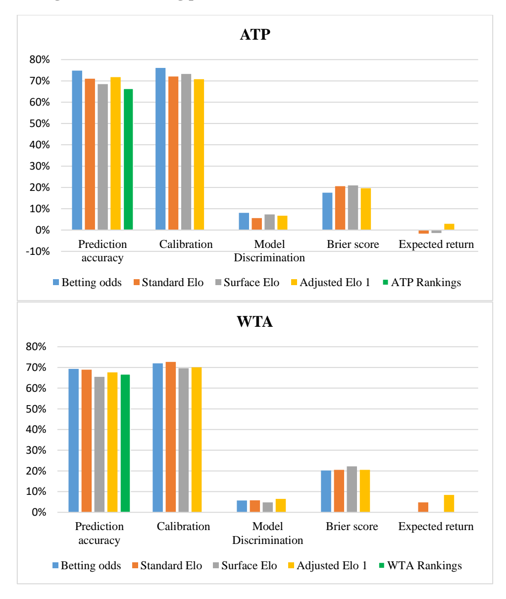
Figure 1: Forecasting performance (Wimbledon 2018 and 2019)

Figure 1 shows the forecasting performance over the two Wimbledon tennis tournaments combined using different rating methods. For men's tennis, we find that the betting odds outperform the other metrics in terms of prediction accuracy, calibration, model discrimination and Brier score. A simple weighted average of overall and surface-specific Elo performs best in terms of expected return. Looking at women's tennis, we find that the betting odds perform the best in terms of prediction accuracy and Brier score, while a simple weighted average of Elo and surface Elo outperforms the others in terms of model discrimination and expected return. The standard Elo ratings performed the best on calibration.