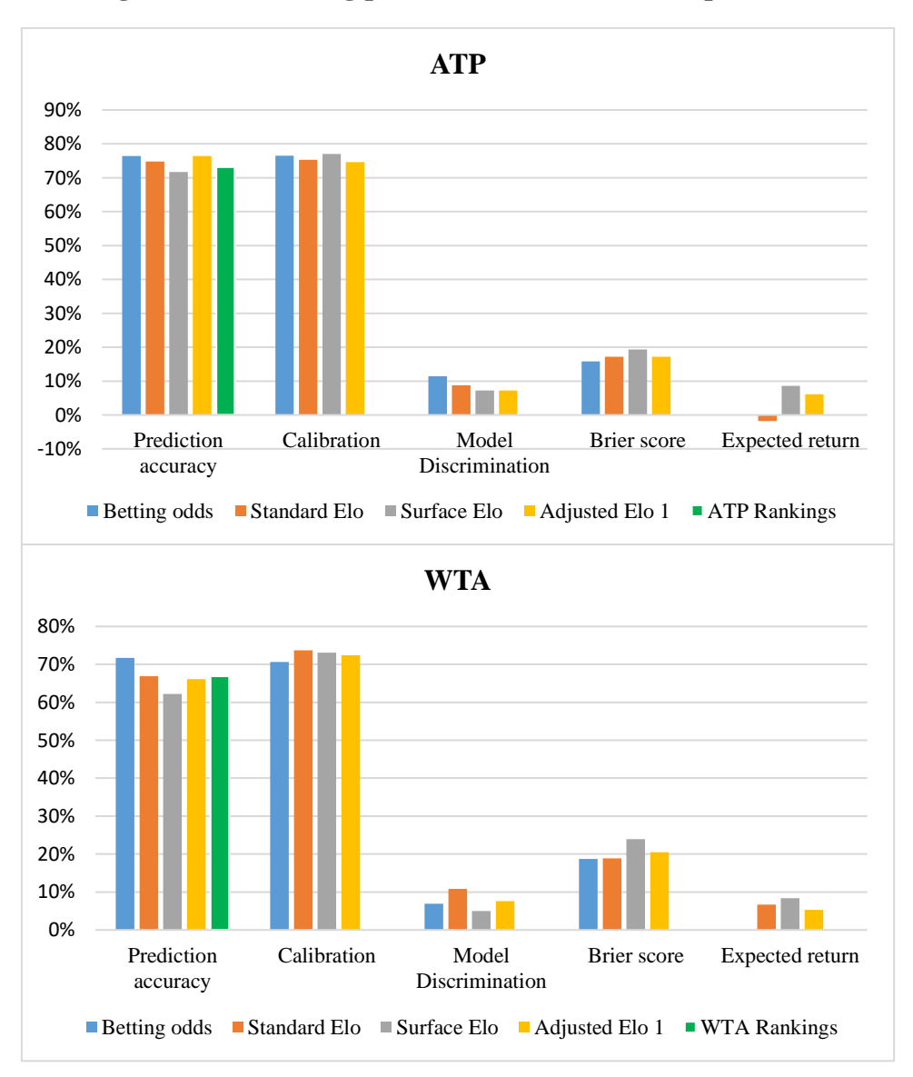
Figure 3: Forecasting performance (Australian Open 2020)

Figure 3 shows the forecasting performance for Australian Open 2020. For men's tennis, we find that the betting odds outperform the other metrics in terms of prediction accuracy, model discrimination and Brier score. In contrast, surface Elo outperforms the others in terms of calibration and expected return. For women's tennis, the betting odds exceed the other metrics in terms of prediction accuracy and Brier score. The standard Elo is the best in terms of calibration and model discrimination. The surface Elo outperforms the others in terms of expected return.