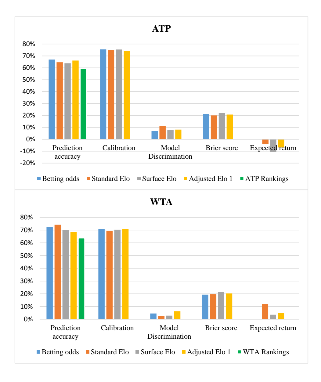
Table 7 summarizes the prediction by an adjusted Elo rating using Elo and surface Elo. We can see that almost all the forecasting measures are improved or at least the same as standard Elo rating in both ATP and WTA.