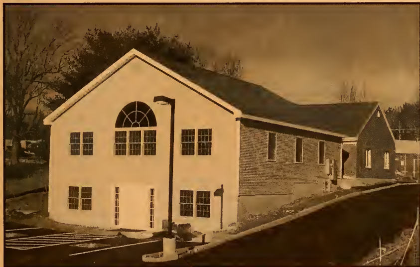
COLBY MEMORIAL LIBRARY, 2003 ADDITION