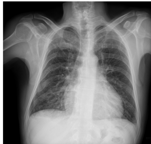
Figure 1 Chest X-ray showing increased cardiac area of a patient with Chagas cardiomyopathy.

The earliest changes indicative of Chagas cardiomyopathy usually appear on the ECG. Right bundle branch disorders and left anterior hemiblock are highly characteristic findings of this stage of cardiac involvement. The other above-mentioned arrhythmias can also be detected on the ECG. Polymorphic ventricular extrasystoles, atrial fibrillation and atrial flutter are associated with more advanced ventricular dysfunction. Ventricular arrhythmias may occur in patients