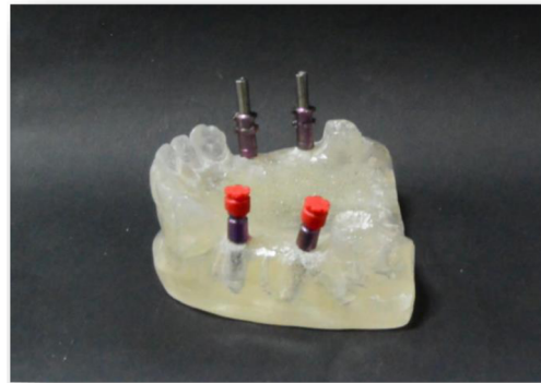
Fig. 2 a Osstem test model with two parallel implants on the left side and two nonparallel implants on the right side. b Straumann test model with two parallel implants on the left side and two nonparallel implants on the right side. c SIC Invent test model with two parallel implants on the left side and two nonparallel implants on the right side.

Figure 2c: SIC Invent test model contains two Parallel implants on the left side and two Non-Parallel implants on the right side.