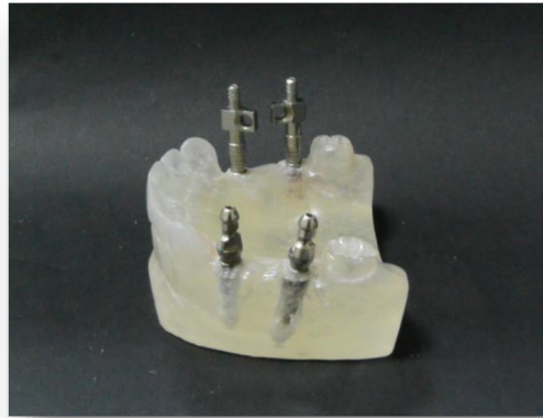
Figure 2b: Straumann test model contains two Parallel implants on the left side and two Non-Parallel implants on the right side.

Figure 2a: Osstem test model contains two Parallel implants on the left side and two Non-Parallel implants on the right side.