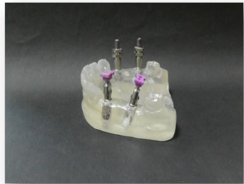
Figure 2c: SIC Invent test model contains two Parallel implants on the left side and two Non-Parallel implants on the right side.

Figure 2b: Straumann test model contains two Parallel implants on the left side and two Non-Parallel implants on the right side.