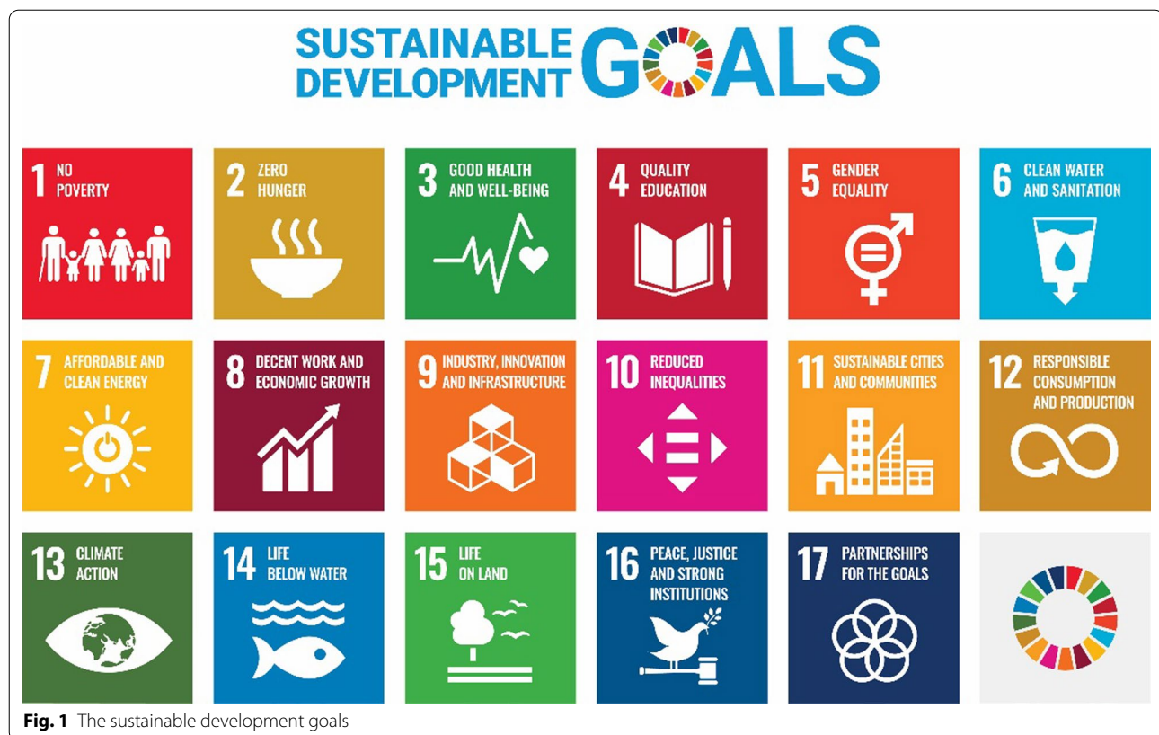
Fig. 1 The sustainable development goals

applied to large-scale system optimization to determine a 'best' system to meet given criteria, and power systems modelling is designed to assess the power system stability and operational considerations. In all cases, the overarching purpose is to identify development paths that will maximize welfare/profits while reducing unwanted consequences. Work to address the interactions between the SDGs into capacity expansion/optimization models includes the climate, land, energy and water systems (CLEWs) modelling framework [4, 5] and the NEXUS Solutions Tool (NEST) framework [6, 7]. These models are designed to choose the optimal development path within the constraints and trade-offs defined in the model structure. Stylianopoulou et al. [8] provide an overview of similar water–energy–food nexus models that have been applied in the literature. These modelling efforts begin to address the nexus between goal 7 (energy), goal 2 (zero hunger), goal 6 (clean water and sanitation) and goal 13 (climate action) but do not, as yet, expand beyond these four goals.