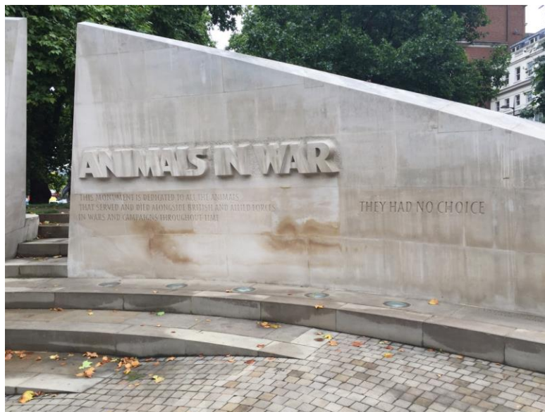
Photo 1 Right Wall of Memorial