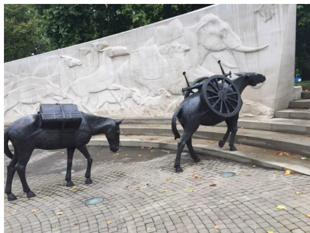
Photo 2 Bronze statue set in center of memorial; Photo: Jeanne R. Rice. Used with permission.