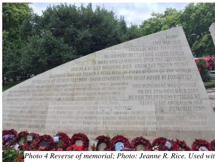
Photo 4 Reverse of memorial

journalists indicates the considerable intersectionality of concern and the study of military animals. The Animals in War Memorial is not solely a product of rising public concern and respect for service animals, nor is it unique to the 21 st century. However, it does represent a much broader understanding of the degree to which humans have depended, and continue to depend, on animals in the military sphere. Up