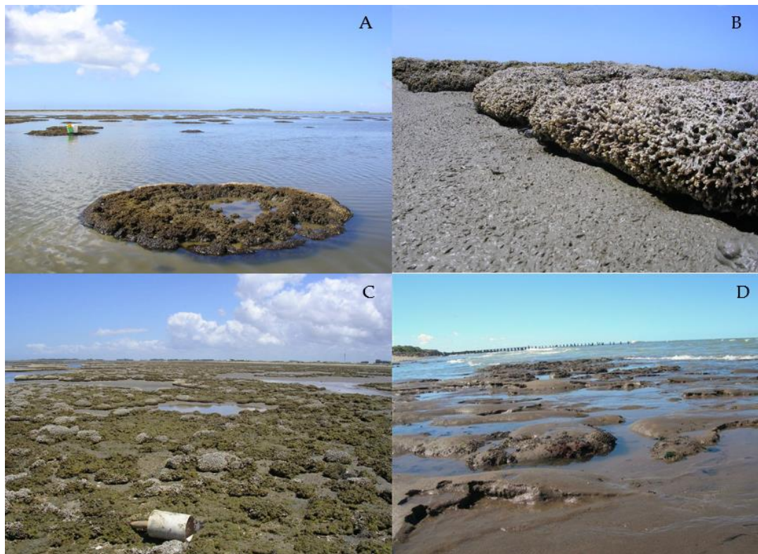
Figure 2. Photographs showing RBP. Reef of Ficopomatus enigmaticus in Mar Chiquita coastal lagoon (Buenos Aires, Argentina) showing different shapes: (A) circular and (C) platform-type. (B) tubes of F. enigmaticus at low tide. (D) Reef of Boccardia proboscidea in sewage-impacted area in Mar del Plata coast (Argentina).