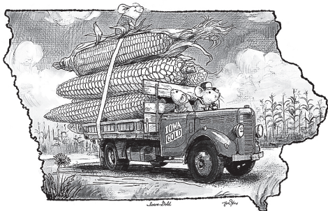
This drawing, titled "Iowa Gold," and many other designs are available for purchase at etsy.com/shop/JoeHoxArt .