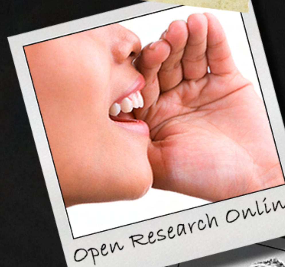
Open Research Online