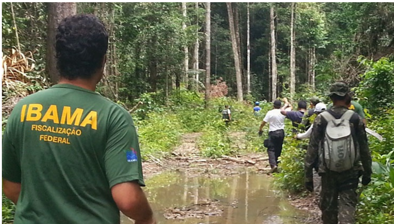
Public prosecutors and NGOs have tried to force the government to do more to honour national and international commitments

In October 2020, the NGO Instituto de Estudos Amazonicos filed another climate case against the government, this time focusing squarely on illegal deforestation as Brazil's main source of greenhouse gas emissions. The plaintiff aims to ensure that the Action Plan for Prevention and Control of Deforestation in the Legal Amazon (PPCDAM) is brought into line with the National Policy on Climate Change, which guarantees a maximum rate of illegal deforestation in the Legal Amazon of 3,925 square kilometres between August 2020 and July 2021. If the government fails to comply with this obligation, the plaintiff seeks the reforestation, as soon as technically possible, of any deforested area that exceeds the annual legal limit.