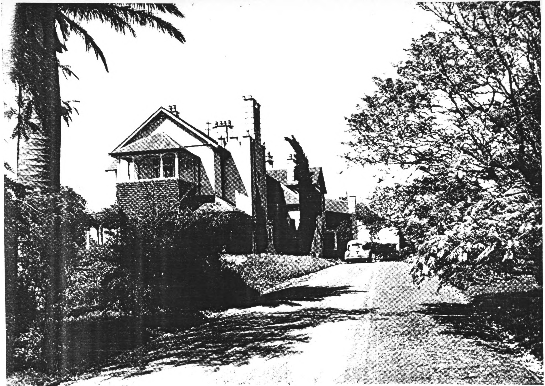
GILBULLA. Situated near Menangle, this training centre for discharged servicemen not yet fit for ordinary employment, is being established by Red Cross. On this property the men will learn market and flower gardening, poultry farming and pig rearing under expert guidance.