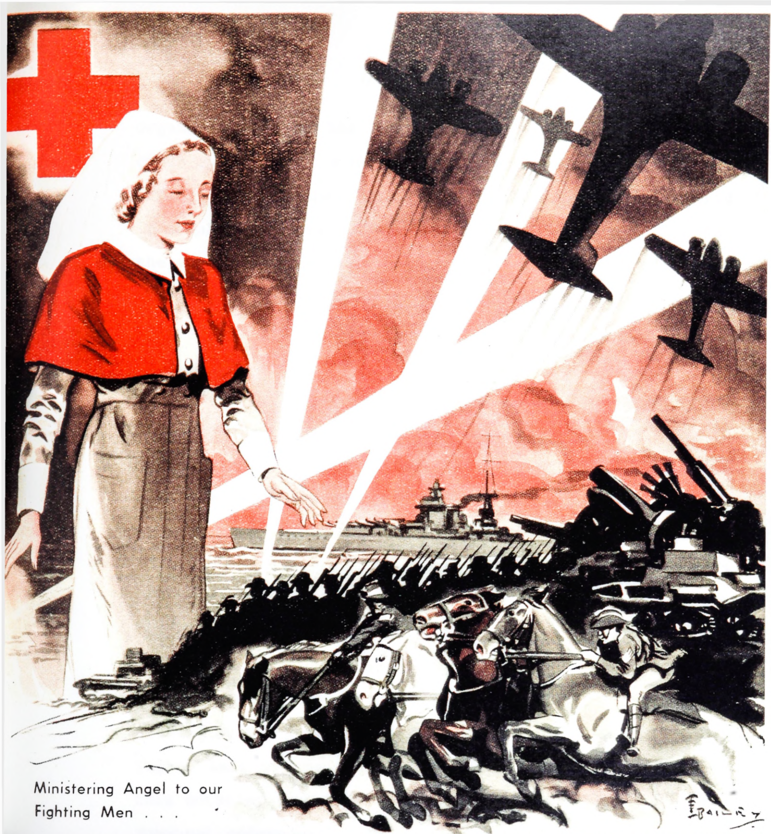
Ministering Angel to our Fighting Men . . .