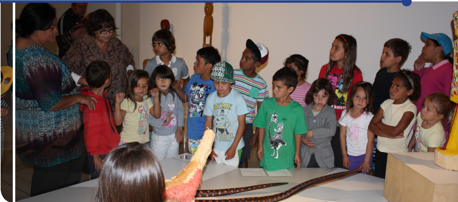
Menagerie: Contemporary Indigenous Sculpture Education visit, Western Plains Cultural Centre 2012.

WPCC, formerly the Dubbo Regional Gallery, has been a venue partner on many Object projects. A very good relationship has been established between the partners. WPCC is always very keen to work with Object, as the staff are confident they will receive quality product. Likewise Object seeks to include WPCC in all its tours as the staff is highly proficient, the venue is excellent and, to ensure that audiences in that part of regional Australia consistently have access to Object's shows.