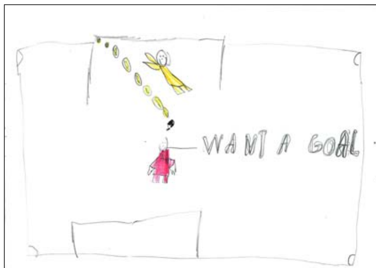
Figure 3. Goran's artwork

Similarly, Goran connected to Mirror through sport, but his motivation comes from the Moroccan side and playing soccer. Goran used pencil and crayon to create his depiction of a shot on goal. A striker in red with his back to the viewer is positioned in front of the goal. The striker is imagining a shot where the ball travels through the air and into the top left corner of the goal. A thought bubble emanates from the striker's head, "WANT A GOAL". Facing the viewer in a yellow uniform is the goalkeeper. Goran has drawn this player flinging his body to the right, arms stretched high in an (unsuccessful) attempt to block the goal. It appears Goran will get his wish.