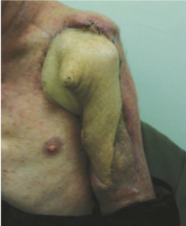
Fig 4. Image of the shoulder 3 months following resolution of disease and free flap coverage.

neutrophil infiltrate may be indistinguishable from infection. Engorgement and thrombosis of small- and medium-sized vessels with tissue necrosis, hemorrhage, and abscess formation may also be seen. 24 Clues to an infectious cause include rapid progression, pain out of proportion to clinical findings, and tissue changes to purple or purple-black. 25 In approximately 50% of cases, pyoderma gangrenosum is associated with underlying conditions including rheumatoid arthritis, inflammatory bowel disease, or hematological malignancy. 26 We made our diagnosis based on a lack of response to broad-spectrum antibiotics and radical surgical debridement, with multiple tissue biopsies being unrevealing for any sign of infection.