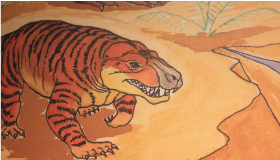
Photograph of "remote times," courtesy of the author.

"Most critics cannot endure the suspension of boundaries between what Ehrenzweig calls the 'self and the non-self.' [...] The bins or containers of my Non-Sites gather in the fragments that are experienced in the physical abyss of raw matter. The tools of technology become a part of the Earth's geology as they sink back into their original state. Machines like dinosaurs must return to dust or rust. One might say a 'de-architecturing' takes place before the artist sets his limits outside the studio or the room." (RSCW 103)