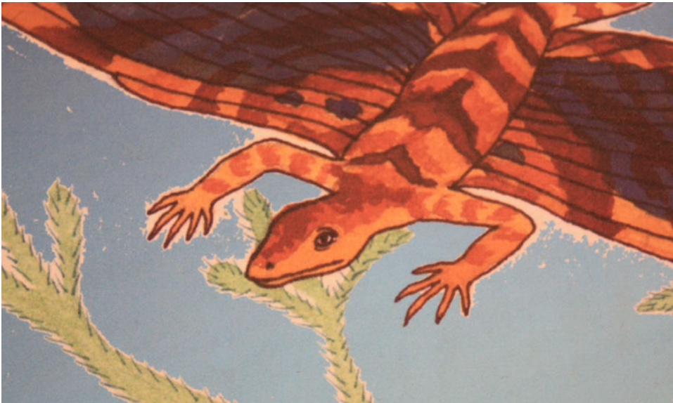
Photograph of "remote times,".

I'm interested in the politics of the Triassic period. —Robert Smithson