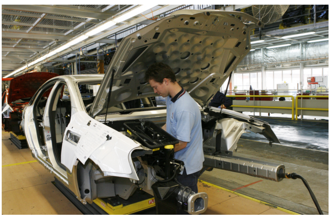
Would Australia's automotive industry survive without government assistance?

The Federal Government will contribute millions of dollars to Australian car manufacturers Holden and Ford in an effort to keep Australia's automotive sector afloat.