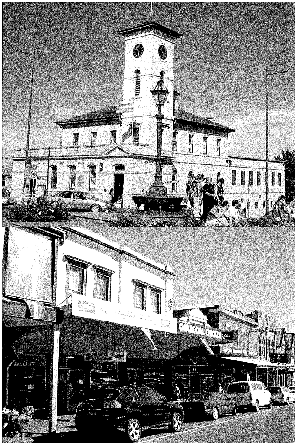
Colour plate 2. Rainbow flags on Vincent Street.