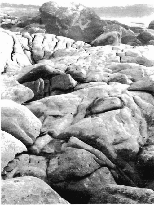
Fig. 8. On the eastern end of Bingie Bingie Point boulders of aplite (up to 24 \text{ m}^3 ) were transported (right to left) across an eroded bedrock surface which displays evidence of cavitation. High velocity stripping of the surface prior to entrainment of the largest boulders indicates two peaks in wave energy similar to that reported for many tsunami wave trains.

and there are definitely no sheeting structures which could account for it. The surfaces also display evidence of bedrock sculpturing. Closed spindle flutes appear on the smooth bedrock surface at the highest point of the seaward edge of the headland, carved into resistant gabbroic diorite. Many of these obviously were formed by the excavation of microfractures running parallel to xenolithic inclusions, but most are very fresh, and are apparently erosional, not weathering features. Moreover, they occur only on the polished and rounded surface of the tonalite at the eastern end of the point, and not on the more highly elevated and weathered surfaces in the centre of Bingie Bingie Point. We suggest that these were formed by extremely rapid excavation of microfractures by wave overwash which was deep enough not only to move the large aplite boulders, but also to generate the high velocities required for the onset of cavitation (BAKER 1978). We have recently reported similar features in association with catastrophic erosion at Tura Head on the far south coast of New South Wales (YOUNG & BRYANT 1992).