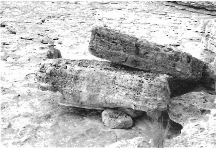
Fig. 3. Imbricated boulders on the sandstone ramp at Little Beecroft Head, Jervis Bay. Waves which moved the boulders ran up the ramp which dips seaward (left to right) at 8°.