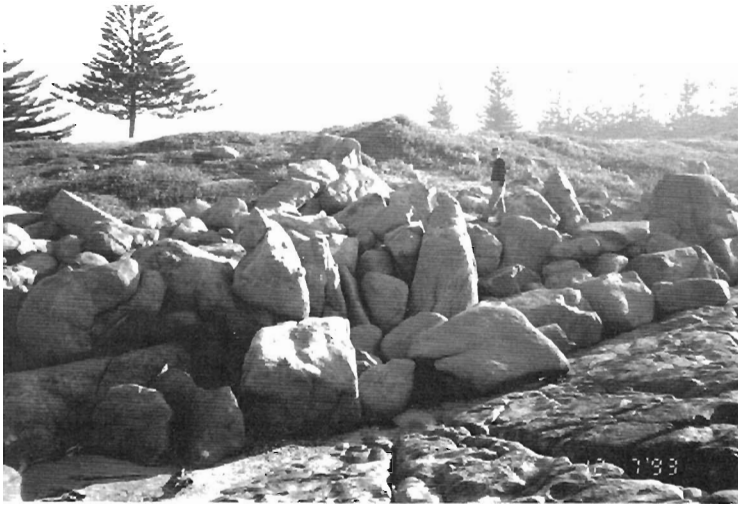
Fig. 6. Elongated train of imbricated boulders at Tuross Heads. Transport was enhanced by the concentration of flow (left to right) through an elongated trough, similar to the "rat-tail" forms of sub-glacial flows, cut in the tonalite.

1989, TINKLER & STENSON 1992). These bedrock sculptured features will be described in more detail in a subsequent paper. The largest of the two boulder trains extends about 200 m downstream. In places the train is only one boulder thick, but the general height above bedrock is 2 to 3 m. Undulations superimposed on this elongated deposit seem to be boulder ripples, for at one location the dominant direction of imbrication is reversed on the lee slope over a distance of about 50 m.