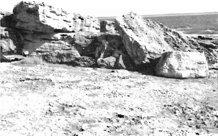
Fig. 5. Boulders on the sandstone ramp dipping left to right at 6^\circ at Honeysuckle Point, Jervis Bay. Note the boulders thrust against the 2 m scarp cut into the ramp. The large boulder weighing about 80 tonnes, shown in the centre of the photo, was lifted vertically from the space immediately below it and rotated 50^\circ .