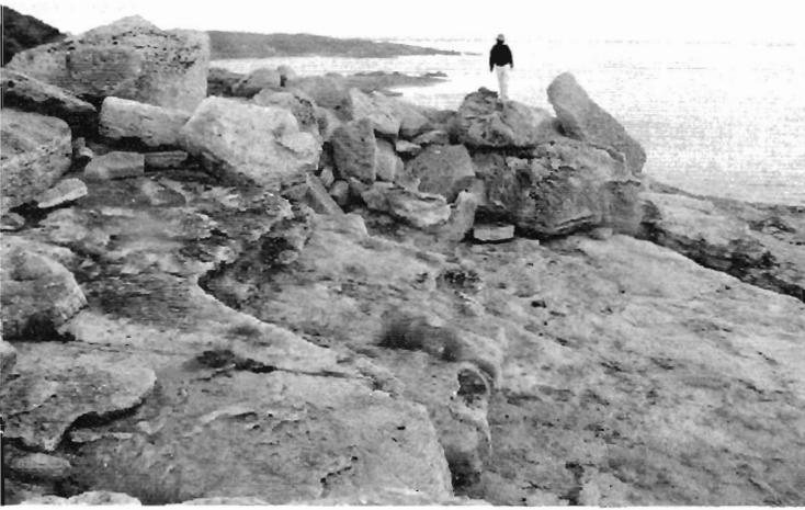
Fig. 4. Boulder pile 9–13 m ASL at the top of the sandstone ramp at Little Beecroft Head, Jervis Bay. The boulders can be traced under a thick vegetative cover to the left of the photo.