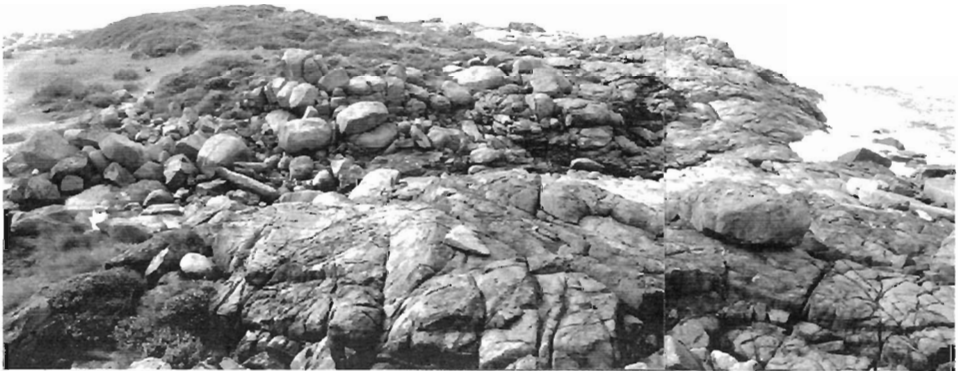
Fig. 7. Evidence of catastrophic overwash at Bingie Bingie Point. Many of the boulders were plucked from the eroded zone on the S.E. shore, transported (right to left) through the central depression, and deposited on the N.W. shore. Boulders scattered across eroded bedrock on the sides of the trough show that the depth of flow was > 5 m.

The smooth, rounded surfaces cut across tonalite and gabbroic diorite at Bingie Bingie Point are impressive (fig. 8). The rock surface is smooth and polished, but this stripping of the weathered rind seems most likely due to very high water pressure rather than to abrasion, because of the almost complete absence of sand or gravel clasts. Furthermore, the dominantly convex rounded morphology is cut in solid rock,