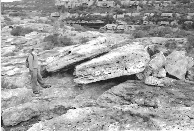
Fig. 2. Imbricated sandstone boulders 32 m ASL above the cliffs at Mermaids Inlet, Jervis Bay. The boulders have been thrust over the remnant of the upmost bed from which they have detached. Note the intensely eroded surface across which waves flowed from left to right.