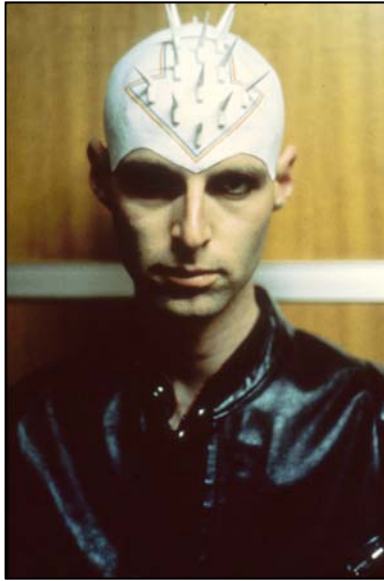
Photograph taken by Jon Cockburn in the studio immediately after completing work on Richard Boulez's head: 'Travelling Head Exhibition', The Watters Gallery, 09 September 1981, stoneware clay and ferro stains on living skin with stoneware ceramic spikes attached (spikes stood 35mm in height), Sydney.