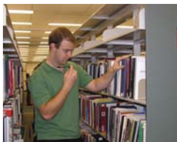
Shelver locates a missing item reported at the Information Desk