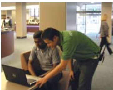
IT Rover helps student set up Wireless