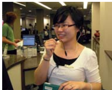
At the Information Desk

Staff working on all levels of the Library are connected by a two-way communication system making it easier than ever to find the right person to offer assistance at point of need.