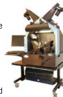
Above: CAVAL's Kirtas 2400 Book Scanner

A project targeting the retrospective digitisation of UOW print theses received before 2002 is underway.