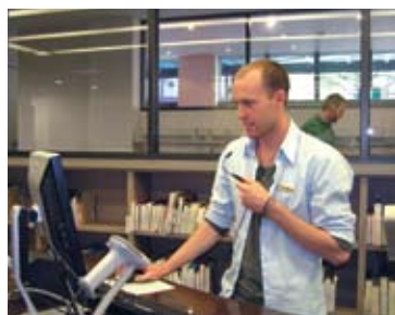
At the Loans Desk