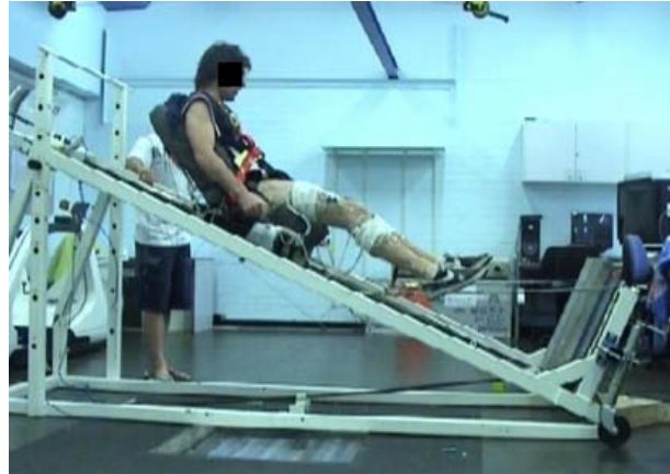
Figure 1: A subject performing the fatigue protocol in the sledge apparatus.

Data Collection: Eighteen skilled male basketball, soccer and volleyball players (mean age = 23.5 \pm 3.6 yr; height = 183.5 \pm 7.4 cm; mass = 80.4 \pm 10.0 kg) volunteered to attend two testing sessions over 2 weeks to complete the study requirements. All subjects had their tendon morphology confirmed by ultrasound prior to participating in the study. During the first testing session subjects were familiarized with the fatigue protocol, which required a series of SSC exercise sets to be performed on a custom-designed sledge apparatus, which consisted of a 23 kg seat that glided along a low friction aluminum track, inclined at 23.6^\circ from the horizontal (Aura and Komi, 1986). After warm-up and familiarization, the subjects performed