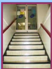
Example 1: Physical feature (low score)