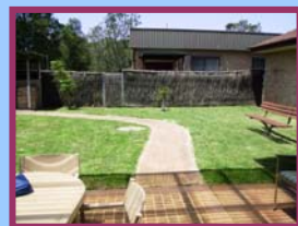
Example 2: Cognitive Feature (high score)