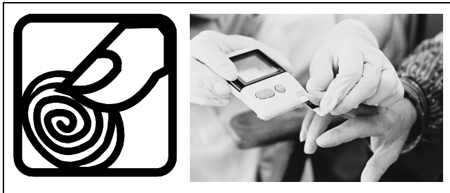
Figure 2. Left: Finger “prints” on the surface of the skin. Right: DNA blood “sample” taken by pricking the skin

In the context of DNA we can almost certainly claim that there is “physical intrusiveness” of a different nature to the collection of surface-level fingerprints (figure 2). In the collection of blood samples we must “break” or “pierce” the skin, in the collection of saliva samples we enter the mouth and touch the inner lining of the mouth with buccal swabs, in the removal of a hair or clump of hair we are “pulling” the hair out of a shaft etc. And it is here, in these examples, where consent and policing powers and authority become of greatest relevance and significance.