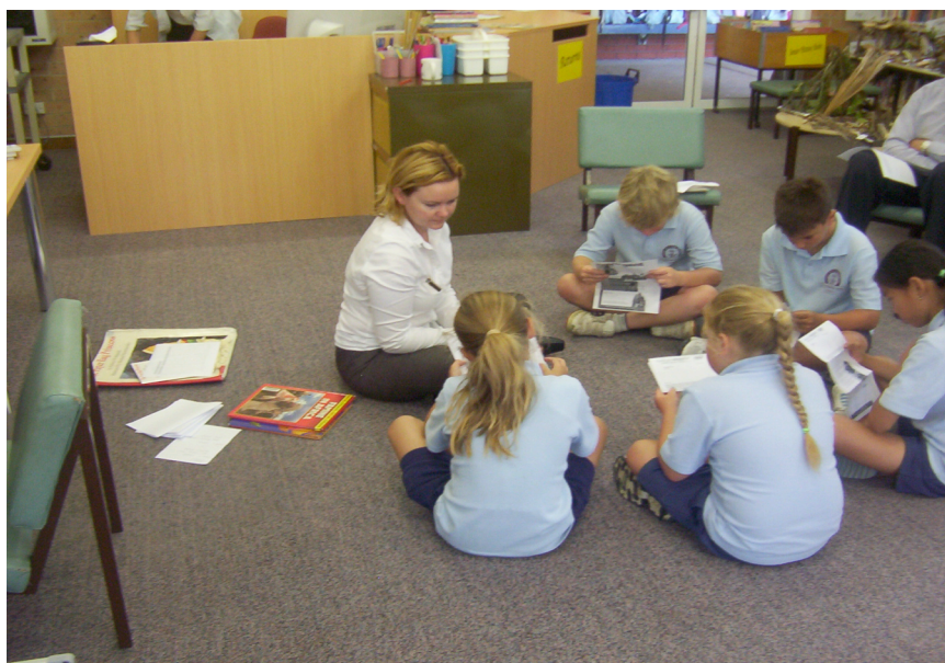
Figure 1: Modelling critical literacy session with children as teachers observe

The academic partner also engaged in periods of modeling with groups of children. During these times, participant teachers were able to observe the interaction between the children and the academic partner with opportunity for subsequent discussion. Figure 1 presents an example of one of these sessions.