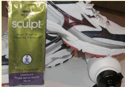
Figure 3: Classroom implementation of idea from workshop (used with permission from Kerrie Auguston)

What has been added? Why have they been chosen? What do they say about the product? Do they make the view better? Will they sell the product?