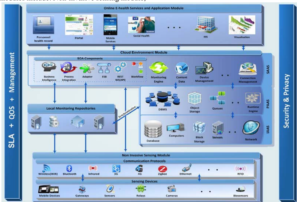
Figure 2. SOA & Cloud enabled Architecture for Smart Non-Invasive Health Monitoring

(1) Non-intrusive sensing devices (e.g. sensors, mobile devices): these are used to sense one or more health parameters (e.g. blood pressure, blood sugar, body temperature, and oxygen saturation) without disturbing the patient’s normal life as such not being aware that sensing activities is taking place. It also includes gateways that serve in collecting data from sensors, process (e.g. filter), and store these data on the Cloud data centers. Many sensing technologies are available nowadays and used to retrieve vital information, and then relay these to the nearest device capable (e.g. gateways) to process these health data. These intermediate relays generally provide an interface to access and retrieve these data.