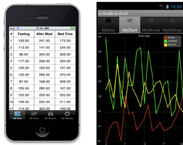
Figure 4. iOS and Android monitoring screen shots

This application exhibits 4 graphical interfaces' views two of whom are depicted in Figure 4: the first screenshot is from the iOS application while the second is from the Android application. Both applications are developed while keeping in mind the User eXperience (UX) on iOS and Android so that users of both platforms benefit from the ease of use and look and feel that are used too.