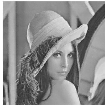
Fig. 5 : Watermarked image