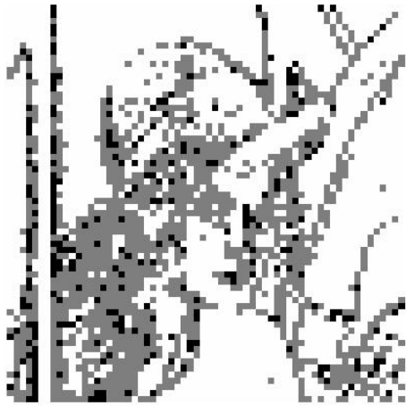
Fig. 2 : Original 256x256 host image