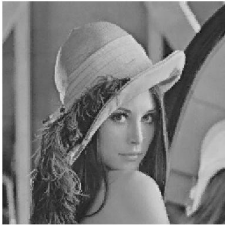
Fig. 4 : Population of different types of blocks

□ : uniform : 71% □ : edge : 22% ■ : mixed : 7 %