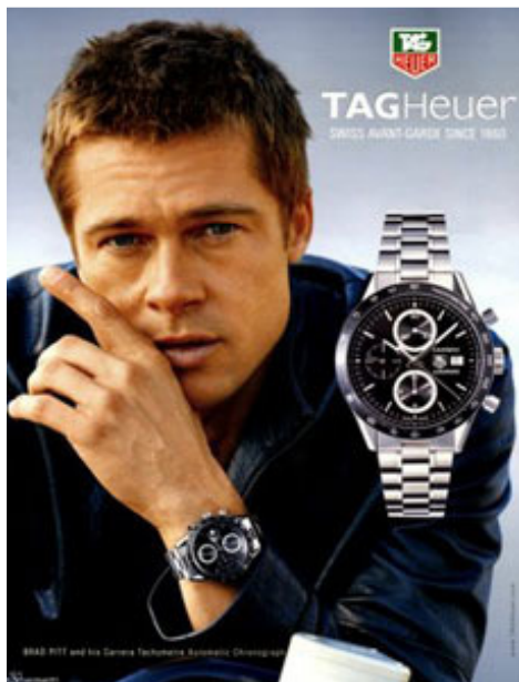
FIGURE 2 Example ads for the empirical study