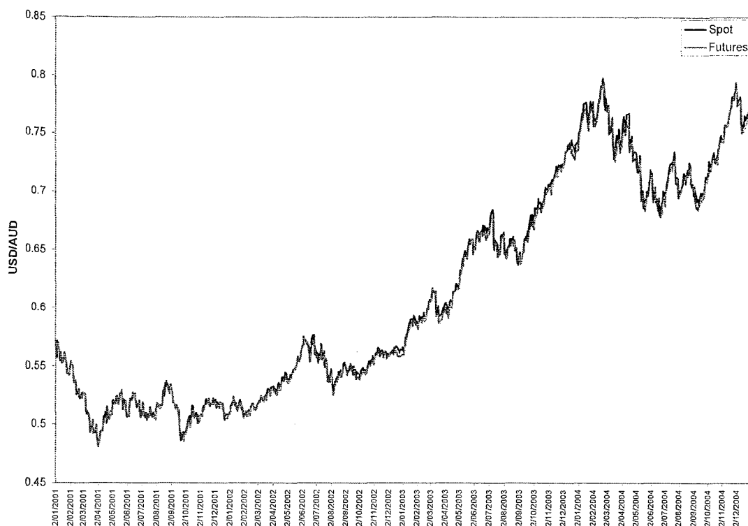
Figure 3. Daily average prices of the AUD futures and spot markets. This plot depicts the daily average mid-prices (sum of bid and ask quotes divided by 2) of the Australian Dollar futures and spot markets for the sample period January 1 2000 to December 31 2004.

Accordingly, the presence of a cointegrating relationship is first examined, before the main analysis, using the methodology specified in Engle and Granger (1987). Two price series are cointegrated if the following two conditions are satisfied: (1) each price series is integrated in the same order, and (2) the linear combination of both non-stationary series is stationary. Therefore, each price series is first examined for stationarity by testing for the presence of a unit root. Many practitioners rely on the augmented Dickey-Fuller (1981) test for this purpose. However, as Perron (1989) notes, failing to account for at least one time structural change in the trend function may bias towards the non-rejection of the null hypothesis 9 . As can be seen in Figure 3, there may possibly exist an exogenous structural break in the prices that may bias the conventional unit root test. Therefore, the unit root test used in this study needs to take