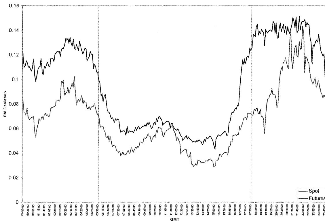
Figure 2. Standard deviation of midpoint of quotes for the AUD spot and futures markets by 5-min intervals. This plot depicts the standard deviations of midpoint of quotes by 5-minutes intervals for the AUD spot and futures markets. The sample period covers from January 1 2001 to December 31 2004. The European trading period, approximately 6:30am to 6:00pm GMT, is represented by the area between the dotted vertical lines.

Using the midpoint of quotes, standard deviation for each 5-minute interval is calculated for both the AUD spot and futures market, as illustrated in Figure 2. Consistent with prior literature (Hsieh and Kleidon, 1996, Hogan and Batten, 2005), a U-shape pattern is observed during the European trading day, with spikes as the Australian, London and US markets open. Additionally, it appears that volatility in the spot market is higher, especially during Australian trading hours.