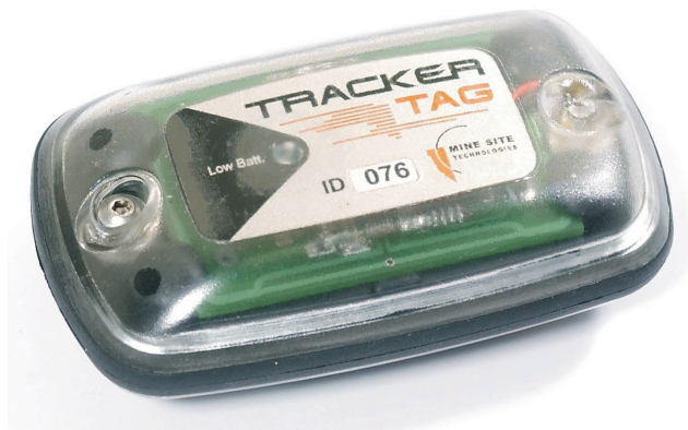
FIG 1 - Self contained Tag.