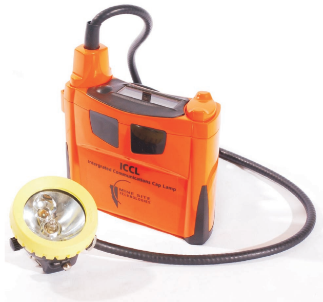
FIG 2 - Tags can also be incorporated into the new cap lamp battery packs.