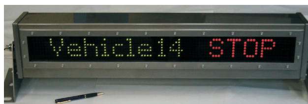
FIG 4 - Zone Display Units can streamline access control to sections of the mine.

With these key drivers, MST is working with Oaky No 1 to implement a tagging system in two stages.