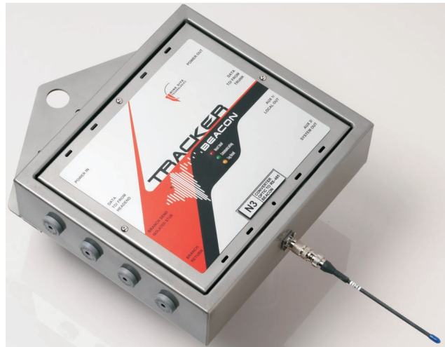
FIG 3 - Read Beacons are placed at strategic locations underground.