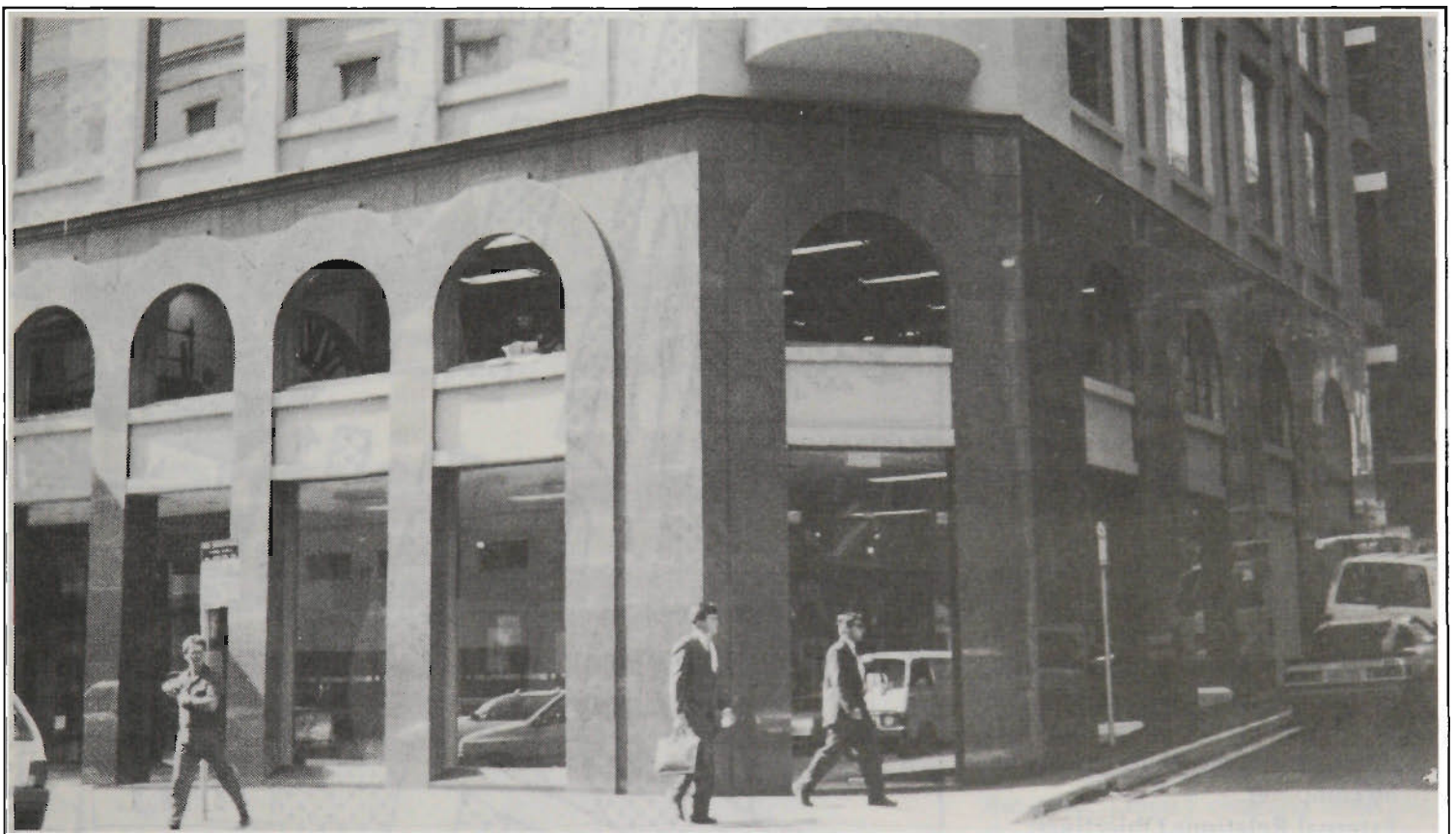
The University Centre in Sydney

The University Centre is a joint initiative by Charles Sturt University, The University of New England, and the University of Wollongong to provide the highest quality promotional, administrative, conference and meeting facilities in the Sydney CBD for all staff and students at the partner institutions.