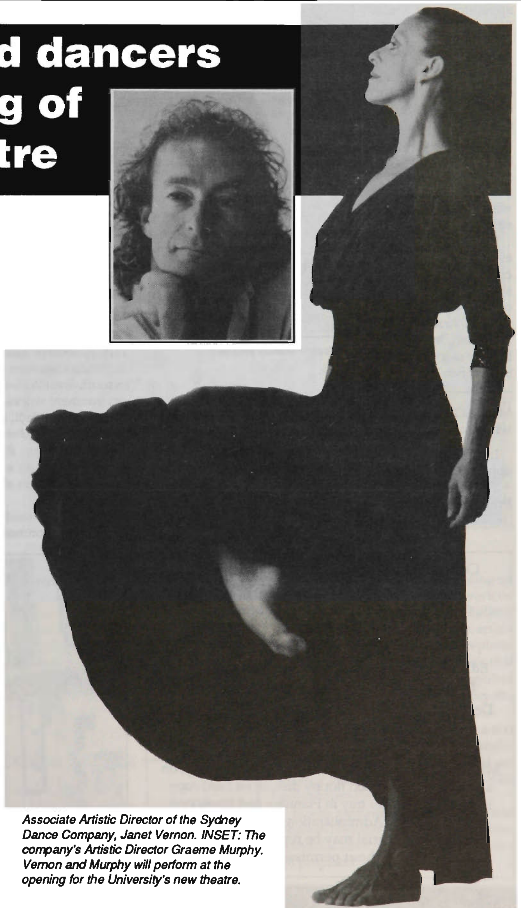
Associate Artistic Director of the Sydney Dance Company, Janet Vernon. INSET: The company's Artistic Director Graeme Murphy. Vernon and Murphy will perform at the opening for the University's new theatre.