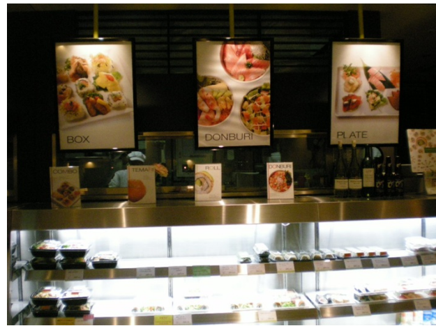
Some of the sushi available at Genji's counter