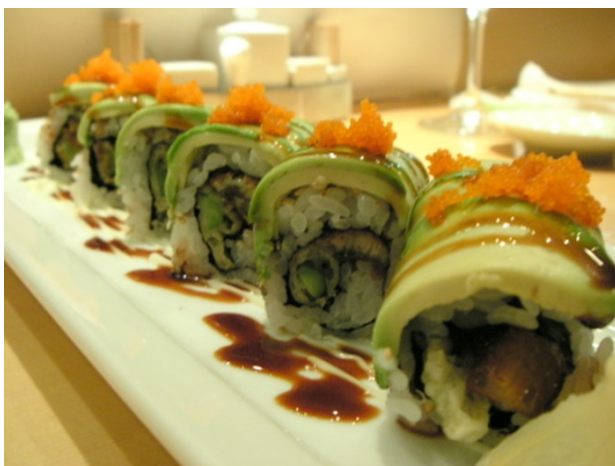
Rainbow Roll Sushi's dragon roll

While Rainbow Roll Sushi and Genji Sushi New York still serve some "traditional" sushi (Rainbow Roll Sushi in particular boasts a sushi counter reminiscent of older, more "traditional" sushi establishments where customers watch their sushi being made in front of them), their main selling points are the image of the US as a fetish for either fashion, health, or difference, which is manifest in unfamiliar combinations of ingredients in highly sophisticated presentations. Such product differentiation enables them to locate themselves within the generic sushi market, while selling things that average sushi restaurants rarely incorporate into their menus in an environment that is quite dissimilar to most sushi restaurants in Japan. Clearly, too, the names of the respective restaurants are relevant in determining their clientele and their products: Rainbow Roll Sushi, written in English and in katakana, unsurprisingly makes and sells a large range of unusual roll sushi. In addition to "standard" American sushi like California Roll or Dragon Roll, they offer an array of original roll sushi with interesting and unexpected combinations of fillings such as fried aubergine, shrimp, jalapeno mayo, raw beef, kim-chee, in very unusual combinations.