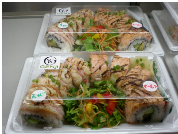
Genji's seared salmon rolled sushi with salad