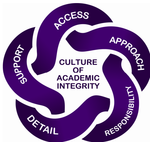
Figure 2: Core elements of exemplar academic integrity policy

Figure 2 below depicts the five elements of academic integrity policy: Access, Approach, Responsibility, Detail and Support. In keeping with our theoretical and philosophical stance (based on the work of East, 2009), we maintain that an overarching commitment to a culture of academic integrity lies at the heart of an exemplar academic integrity policy because without this commitment the five elements do not work coherently and consistently together.