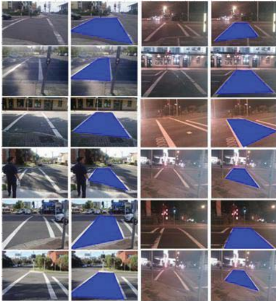
Figure 3. Visual results of lane detection. Columns 1 and 3: input images. Columns 2 and 4: detected pedestrian lane regions.

For comparison purposes, we implemented the Hough transform-based method (HT), which is commonly used in lane detection, e.g. [7]. Another method used for the comparison is the work of Lee and Cho [5] using colour information to extract lane marker pixels and edge orientation information to estimate lane boundaries. The detection performance of these methods are summarised in Table 1.