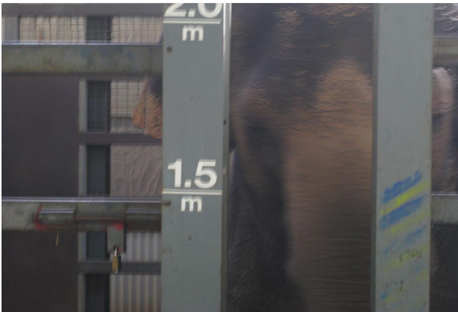
Figure 6 - Taronga Western Plains Zoo – NSW, Australia, 31-08-2013

Now there is Whipsnade Zoo, associated with London Zoo but located in the countryside. Like rural Australia’s Central Plains Zoo, which is connected with Taronga Park in Sydney, Whipsnade offers quite generous architectures of moats, steep embankments and relatively open spaces. It is far removed from the crush of cages that punctuate the maze of pavilions and other Victorian façades of the ‘zoological gardens’ that gasp and sway in the fug of a London summer.