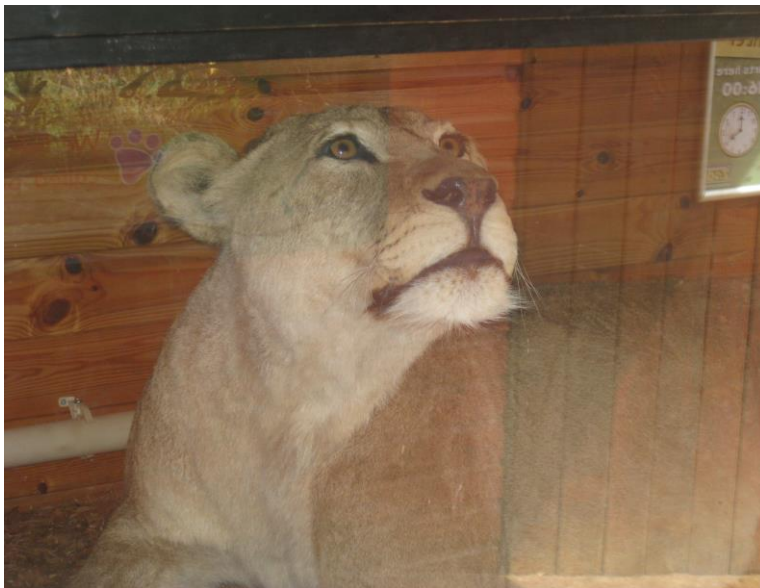
Figure 7 - Colchester Zoo – Essex, UK, 27-06-2010