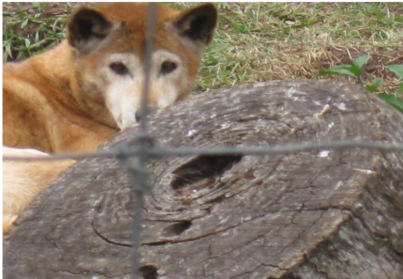
Figure 12 - Darling Downs Zoo – Queensland, Australia, 28-07-2013

Two dingoes lounge about in little more than a chook pen. Not much is needed to keep these two zoo-illogical exhibits at bay. The hedgerow of native shrubs surrounding the wire fence serves to dissuade our foolish fingers from touching those doggy noses, or maybe even scratching a golden ear. They could bite, of course. But, honestly, they seem such a pair of erstwhile puppies, one still lanky and alert, the other grey muzzled, and squinty-eyed, same as the old dog at home, who snoozes all day in the sun, dosed-up on fish oil and other such supplements for old bones.