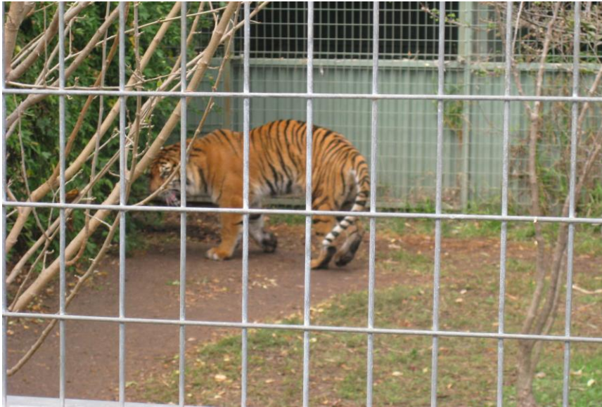
Figure 11 - Darling Downs Zoo – Queensland, Australia, 20-06-2013

Beyond the faded photo and info sheet that hangs limp against the steel and Colorbond fencing, a tiger paces.