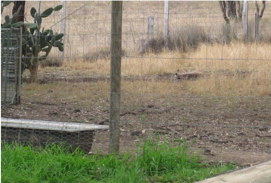
Figure 10 - Darling Downs Zoo – Queensland, Australia, 20-06-2013

Claw-footed bathtubs are glimpsed through chicken wire and cyclone fencing; each squat rotundity is like a pygmy hippopotamus, bone-bleached beyond the shade of coolabah and corrugated iron.