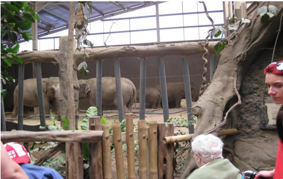
Figure 5 - Chester Zoo - Cheshire, UK, 24-06-2010

(i) It looks like seniors' day at Chester Zoo, here in the north-west of England's green and pleasant land. Young aged-carers, with pink or green hair and piercings, carefully steer their charges into position within the gridlock of wheelchairs along the railings of the enclosure. The elephants turn away, as is their wont when the crowds gather. All except the matriarch present their backsides to these squat spectators, while she faces the elderly square-on, eyes their snowy heads, hunched shoulders and idle limbs. Elephants and the elderly alike are in cages of a sort. Some are in harness, chin-on-chest, nodding forward in their chairs, others rocking from side to side – all wanting to go home.