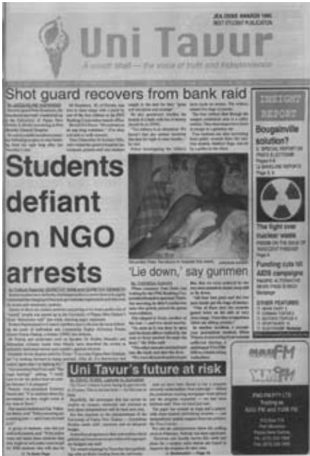
Figure 1: A Uni Tavour front page reporting a bank raid at UPNG, 16 May 1997.

Students defiant on NGO arrests UN hails PNG human rights charter Bougainville solution? Promises and lies Don't blame us after the poll, warn key women (Headlines from Uni Tavour , 16 May 1997 – last edition before the 1997 general election). (Figure 1)