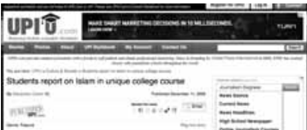
Figure 2. A screen shot of an article on the course “Reporting on Islam” published on the wire service.

Taken together, the comments reveal that the course was meaningful for him: It “definitely made me uncomfortable at times, but honestly, that is how I know it was worthwhile ... It helped me experience a part of the world and this country that I never had before.”