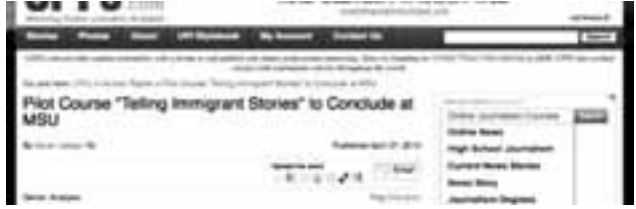
Figure 3. A screen shot of an article on the course “Telling Immigrant Stories” published on the wire service.

Interviews with students, publication of students’ work produced in these courses, and coverage of the best-practices documents testify to the success of the wiki projects. This supporting evidence should encourage other instructors to employ similar methods as a way of promoting learning among adult students.