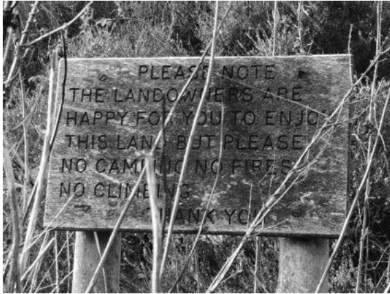
Figure 3: Enjoy the land! Image by Robert Herian

Establishing and importantly also formally recording rights of way, on an Ordnance Survey map, for example, has long been important to ramblers and those who enjoy walking in the countryside. Accurate knowledge of rights of way opens the countryside for exploration. It would be too much of a distraction to talk in depth here about property law. But, worth briefly noting is that, whilst we might commonly think of “property” as a physical thing such as a car or a piece of land, the law regards it instead as a bundle of rights . Among these rights is the right to exclude, which, in land, means the right to stop people from entering (trespassing) or crossing privately owned land. One reason a right of way is significant, therefore, is because it represents a compromise between owners