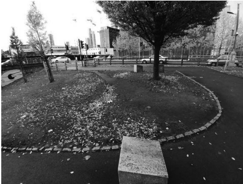
Figure 8: Desire Line in Manchester .

The materiality of the pathway plays an important role in encouraging us to use it rather than not. Walking on an asphalt or tarmac pathway is arguably preferable to the mud of an informal pathway or the wet grass. This isn't only a question of a discipline as we have described it so far, therefore, but concerns a whole array of other "civilizing" criteria adopted by societies in which bureaucratic efficiency and maintaining economic viability in all walks of life is the absolute aim. As Tim Ingold says, 'In modern societies, it seems, straightness has come to