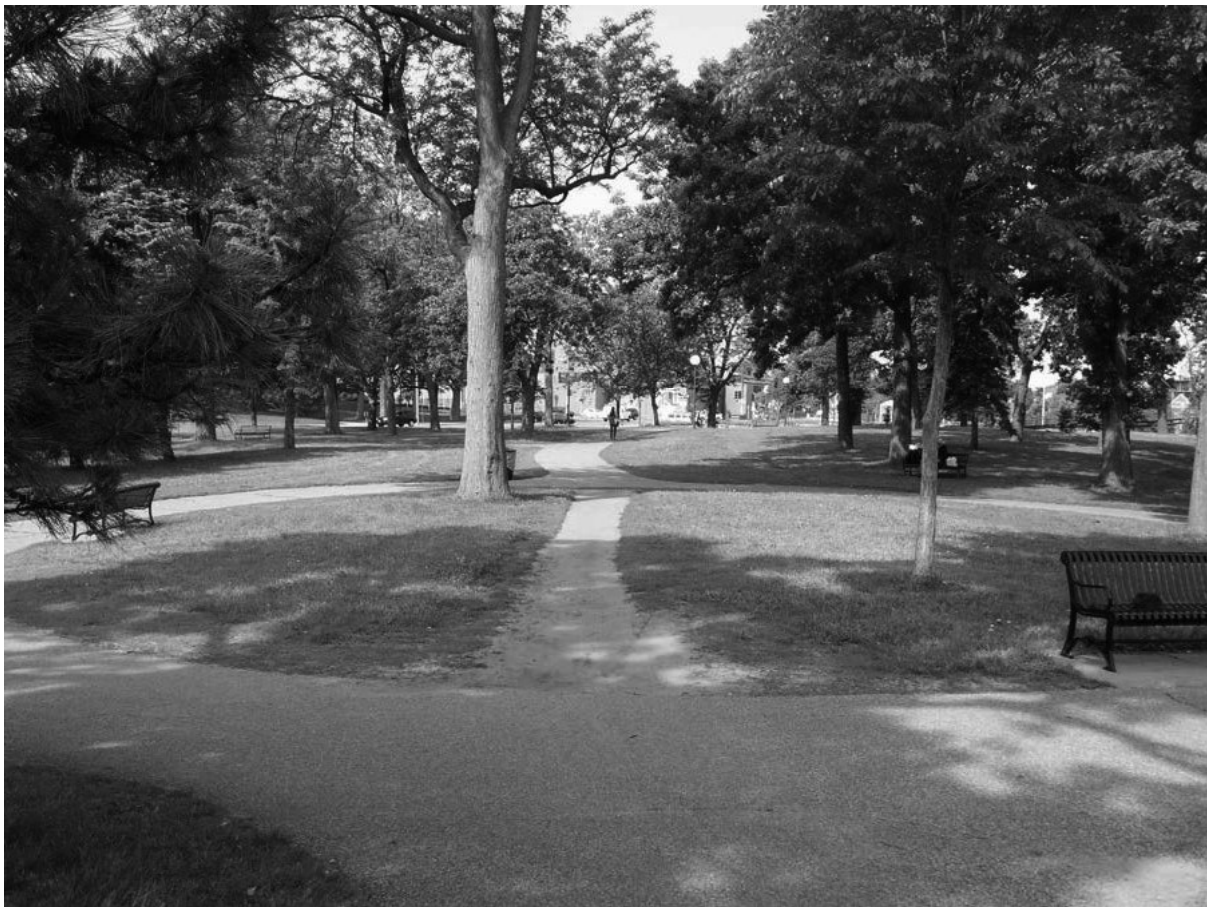
Figure 6: "Desire line" by Eric Fischer is licensed under CC BY 2.0

How do law and legal norms shape space and the way bodies experience and move through it? Bodies can respect, defy and resist laws, but never disregard them. As a strategy for the coming day, we intertwine the political with law in accounts of property, spatial justice, and the negotiations of socialized bodies, each with desires, demands, anxieties and frustrations. Recognizing points in which law and bodies meet in space in subservience to (or the creation of) norms is difficult, however. Law, all too often, is invisible, unconscious, missed. A desire line across a local park represents combinations of forms and expressions . Using an image of a typical park, like the one in figure 7 , we can audit the space for its material and symbolic content to examine these forms and expressions.