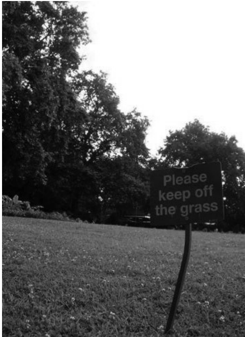
Figure 7: “welcome” by Laura Billings is licensed under CC BY-NC 2.0

Other than benches, the planned park in figure 7 has well-tended green spaces around which wrap a uniform network of pathways that lead the walker in a defined and ‘disciplined’ manner. It doesn’t appear to be the case in our present example, but some planned spaces with green space, such as a well-manicured lawn for example, will request walkers stay on the path by asking, often politely, to “please keep off the grass”. This raises a further interesting point about the role of discipline in the governance of public spaces. While the sign politely states “please keep off the grass”, the likelihood of receiving a formal legal sanction or punishment as imprisonment or a fine should you decide to ignore the sign is very unlikely. Instead, the sign relies on extra-legal principles and rules of conduct such as common sense and good manners. The aim, simply, is to ask politely and expect this to be respected.