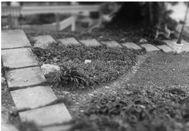
Figure 1: Just that bit quicker! Image by Robert Herian

You will probably use a desire line in your life or already rely on one to make a habitual journey on foot or bicycle just that bit quicker. At the very least you will have seen these lines criss-crossing the grass of a local park between 'formal' pathways or bisecting a verge by the side of a main road to give the user a more direct route to the other side. A desire line is an informal path that enables a direct journey , what we might also call a short-cut or in some circumstances a detour . As well-trodden pathways, desire lines imply a wish for straightforwardness and greater efficiency than planned spaces provide. However, desire lines are more sophisticated and nuanced than this,