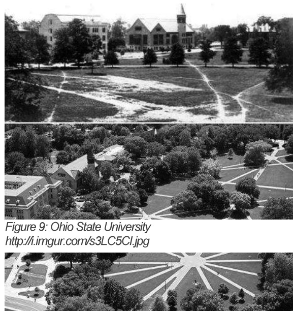
Figure 9: Ohio State University http://i.imgur.com/s3LC5Cl.jpg

Looking at the path in figure 7 we might say that all these efficiency gains we have discussed would be modest. The distance isn't far, and the savings made not all that great. And yet, its well-worn appearance tells us that people continue to use it regularly, almost to where we can say it is now the de facto formal path rather than an alternative or detour. As we saw in the earlier section, looking at the transition of informal pathways to formal pathways, we can see that how desire lines end up shaping the planned landscape is not new. Instead, it holds a firm place in planning orthodoxy, especially concerned with demands to increase efficiency. As at Ohio State University, where the transformation of the landscape by desire lines is obvious, and incorporating them into the planned space was the only realistic option. In our park the desire line may eventually be formalized, may become another of the planned routes. Albeit a formal path that memorializes the failure of planning either to predict user behaviour or maintain discipline.