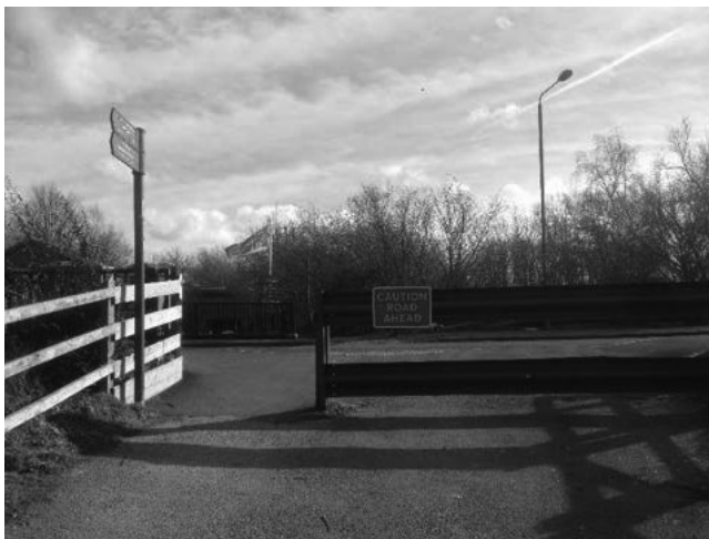
Figure 4: Disciplining movement. Image by Lucy Atherton

and non-owners within the context of a broader private property regime. While the right to exclude absolutely might be preferable economically (it can secure and maintain land value for example, e.g. in cases of so-called “land-banking”), from the point of view of social and what we might also call spatial justice , including giving people a reasonable opportunity to explore and enjoy their environment, rights of way are a precious if limited sharing of space.