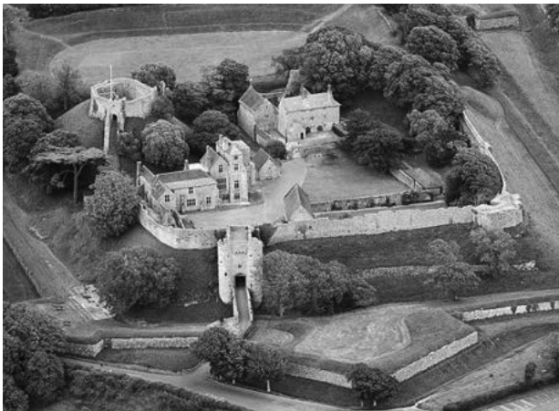
Figure 10: Carisbrooke Castle.