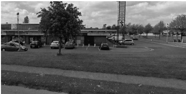
Figure 11: Mountview Shopping Centre.

On 25 th February 2016 the Irish Times reported the following story: