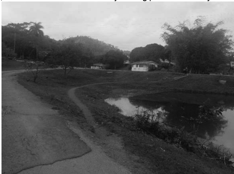
Figure 5: The Efficient Route.

The idea of stepping off or leaving the beaten track may be romantic or fill us with a gratifying sense of mischief. As alternatives to the norm, desire lines are manifestations of a type of rejection of formality and thus also an attempt to reject the discipline that accompanies it. Yet we all eventually fall back into line, return to the paths we should be on, don't we? Desire lines exist only to bring points of formality closer together, not to undo or destroy formality, or postpone it indefinitely. When we stop to think about this, of course, the very idea of leaving the beaten track, romantic or not, means nothing without having a beaten track to begin with. Law clearly makes distinctions between formal and informal pathways, but as the title of this section implies, what is formal is always already (in)formal. Informality breeds formality, and informal ways, in turn, are re-found in formal, planned spaces. All pathways intertwine to produce what Michel de Certeau calls 'a rhetoric of walking':