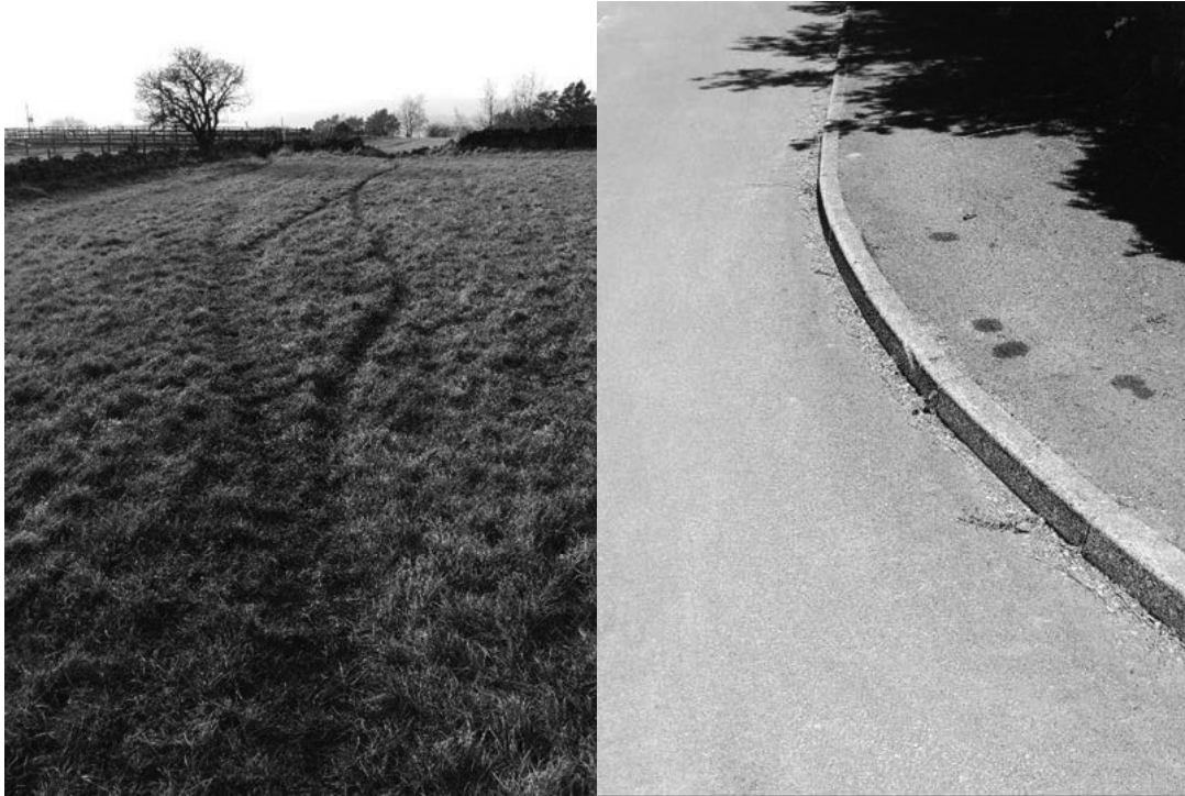
Figure 2: Footpath & Footway. Images by Robert Herian

Of the two perhaps public footpaths, especially in the countryside, seem less planned than their asphalt counterparts, pavements. Yet, both show human ingenuity in planning routes and journeys that inscribe the physical landscape, while creating rights of way that describe legal character within the landscape. For good or ill, and like writing on a page, pathways tell stories of movement through traces that begin tentatively (informally) but inevitably become fixed and formal. The formalization of pathways is described in law by the establishment of rights of way: