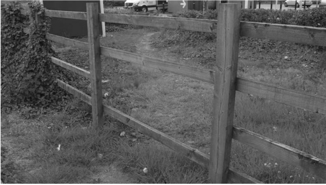
Figure 12: Avanti! Image by Lucy Atherton