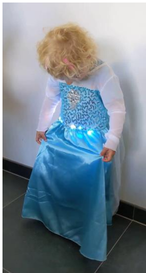
Figure 1. An embedded system running Olaf. Music in the environment is recognized and LEDs are lit in sync.

Olaf runs on embedded systems. On embedded platforms memory and computational resources are severely limited. Olaf is written in ANSI C with these restrictions in mind. Olaf targets 32-bit ARM microcontrollers with at least 256kB memory such as the Arduino Nano 33 BLE, the ESP32 or the Teensy 4.0. As far as I know this is unique for an acoustic fingerprinting system and allows innovative IoT music recognition and synchronization applications. The original motivation behind Olaf was to give my daughter a modified “Elsa-dress” for her birthday. The modification added a LED-strip which lights up when, and only when, ‘Let It Go’ from the Frozen soundtrack is playing.