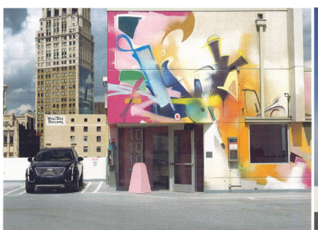
FIGURE 3. GENERAL MOTORS ADVERTISEMENT (LEFT)<sup>192</sup> AND FALKNER'S MURAL (RIGHT)<sup>193</sup>

motion for summary judgment by differentiating it from Leicester .<sup>188</sup> Whereas the towers in Leicester were "designed to appear as part of the building or to serve a functional purpose that was related to the building," the creative decisions involved in the mural in Falkner were completely unrelated to the functional purpose of the parking garage. Thus, the court declined to find as a matter of law that the mural was "part of" the parking garage because it was factually distinguishable from the factors mentioned in Leicester . Falkner settled prior to trial. 191