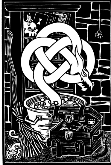
Figure 4: White Dragon