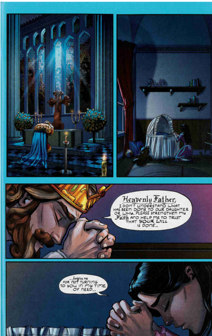
Figure 9: Volume 2, Praying

While the characters in the fairy tale are active agents in the narrative, there is a sense that their actions are at the mercy of God. Those who pray and give thanks to God survive. Princess Makemnoit is defeated, as the Lord’s Prayer delivers the characters from evil. Upon Makemnoit’s demise, the final scene in The Light Princess series finds the Queen remarking, “One cannot repay evil for evil. Evil can only be overcome with good” (Volume 5). That sentiment can be found in much of MacDonald, particularly in Phantastes written six years before “The Light Princess”: “What we call evil, is the only and best shape, which, for the person and his condition at the time, could be assumed by the best good. And so, Farewell ” (196). Cave Pictures’ George MacDonald’s The Light Princess ends very seriously, which is the dominant tone throughout the series: by eliminating the playful aspects of the original fairy tale, Finch’s version emphasizes the moral and religious seriousness of MacDonald.