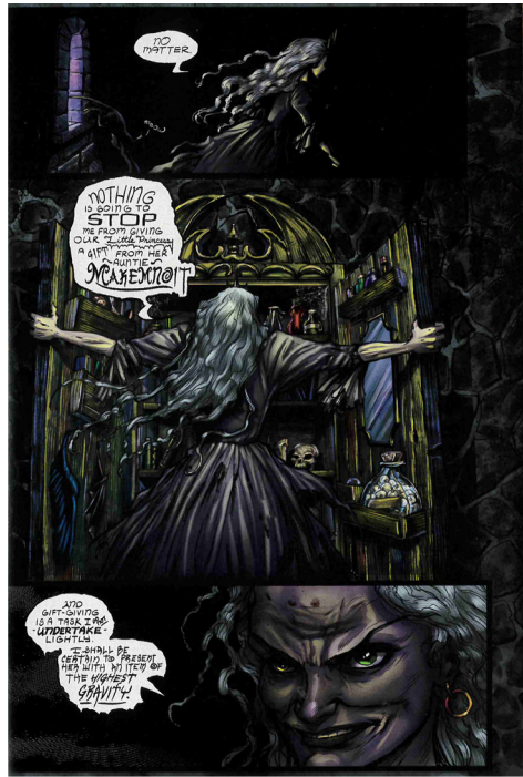
Figure 8: Volume 1 Makemnoit The Light Princess , Cave Pictures Publishing

Much of Cave Pictures version follows fairly accurately MacDonald's original related to the Light Princess and the young Prince, who falls in love with her and is willing to sacrifice himself for her. What Cave Pictures' version does do, however, is consistently remind readers of the overt religious dimension to the retelling by having characters seek guidance from God, as seen in the following two images. Figure 9: Praying depicts the King praying for his daughter, who is now cursed without gravity; the Queen, in turn, confesses that she did not put her trust in God, further supporting the need for faith in God. Figure 10: Our Father comes near the end of the series when the Prince, who nearly drowns plugging the hole so the waters return to the Light Princess's lake and save her, is in need of salvation. The Light Princess recites the Lord's Prayer from Matthew 6: 9-13. Earlier, on the lake, the Light Princess must save the Prince. As the Prince is slowly drowning, the Light Princess again echoes the words of the Bible, particularly Matthew 26:26, as demonstrated by Figure 11. The eating of bread and the drinking of wine replicates Christ's requests at the Last Supper.