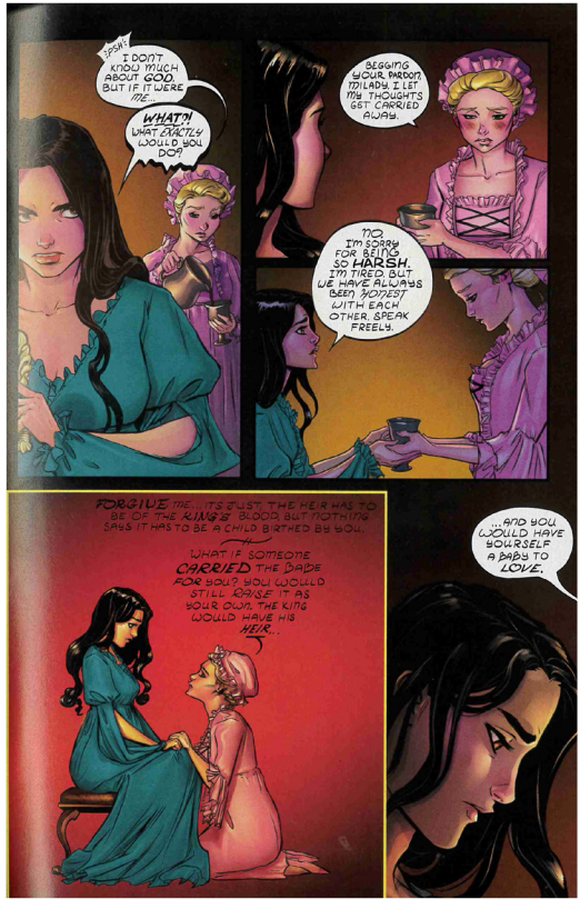
Figure 7: The Proposition The Light Princess , Cave Pictures Publishing