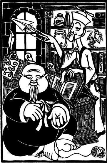
Figure 3: Philosophers