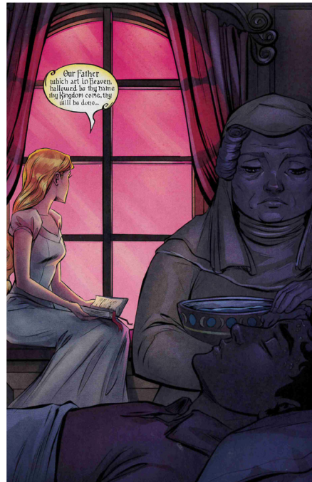
Figure 10: Volume 5, Our Father

The Light Princess , Cave Pictures Publishing