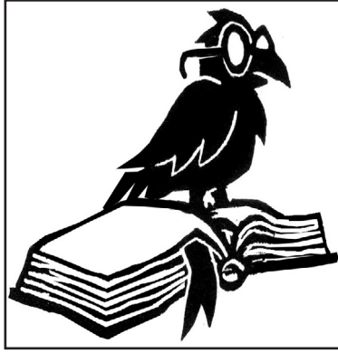
Figure 5: Librarian The Rabbit Room

Rabbit Room’s version of “The Light Princess” performs a dual service of respecting the integrity of MacDonald’s fairy tale while illustrating the tale in a unique way that plays with images from classic fairy tales and the fantasies and of MacDonald, while adding a religious dimension by subtly evoking images from religious iconography and symbolism.