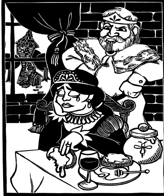
Figure 2: Honey Queen The Rabbit Room

readers of the evil Princess's curse. Honey flows on the bread from the honey pot, which seems to depict a bee that is closer to cross than insect. And, of course, the most obvious image is the bread and wine.