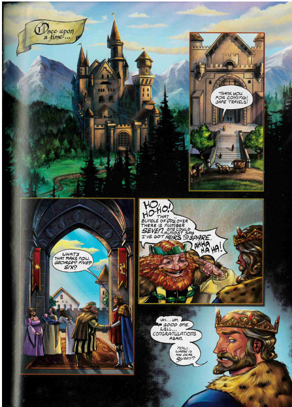
Figure 6: Once Upon a Time The Light Princess , Cave Pictures Publishing

of North Wind: A Journal of George MacDonald Studies could not replicate the Cave Pictures images in color. To see them in their original color, please go to the online version of this article at https://digitalcommons.snc.edu/northwind/ .) The lettering creates a more ancient look, as if in medieval times, as if in a fairy tale. The page defies clear linear reading, with three inserted panels forcing the reader to move left to right, up and down; each volume in the series maintains this graphic format throughout. The word bubbles show that the story will primarily be told through dialogue, thus necessitating a revision that conveys the fairy tale in a different method than the original, which is highly descriptive and is consciously self-reflective, as the narrator interjects personal comments throughout.