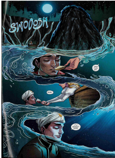
Figure 11: Volume 5, Eat, Drink The Light Princess , Cave Pictures Publishing

At the end of Adela Cathcart , Adela is cured of her ennui. The Light Princess, similar to Adela, is cured of her curse, falls in love, and can now literally fall as she gains her gravity. The narrator John Smith, the primary storyteller, directly confronts readers and asks a pointed self-reflective question for them: “Pray, Mr. Smith, do you think it was your wonderful prescription of story-telling, that wrought Miss Cathcart’s cure?” The answer: “Probably it had its share” (459). Earlier in the novel, “The Light Princess” was one of those stories. At the end of the fairy tale, the schoolmaster makes a small complaint, “I don’t think the princess could have rowed, though—without gravity, you know.” Adela replies, “But she did. I won’t have my uncle found fault with. It is a very funny, and a very pretty story” (103). Though there is no consensus amongst the listeners about what the moral of the fairy tale was, Mr. Armstrong, the doctor, admits that “there is a great deal of meaning in it, to those who can see through its fairy-gates” (104). Rabbit Room and Cave Pictures Publishing both open the fairy-gates of “The Light Princess” to show how the fairy tale can have a clear Christian moral when you retell it in unique ways.