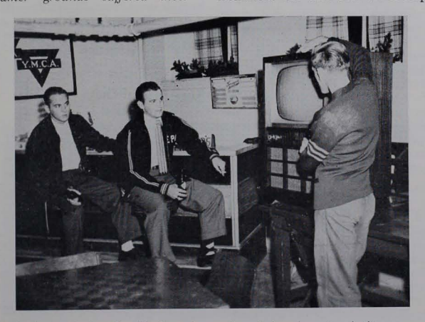
Students enjoying the "Rec" center, re-decorated and equipped this year by the campus "Y" groups.

More than ever this year the "rec" center has been fulfilling its intended purpose. Completely re-decorated last September by the members of the "Y" organizations, the center has a refreshment bar and soft-drink dispen-