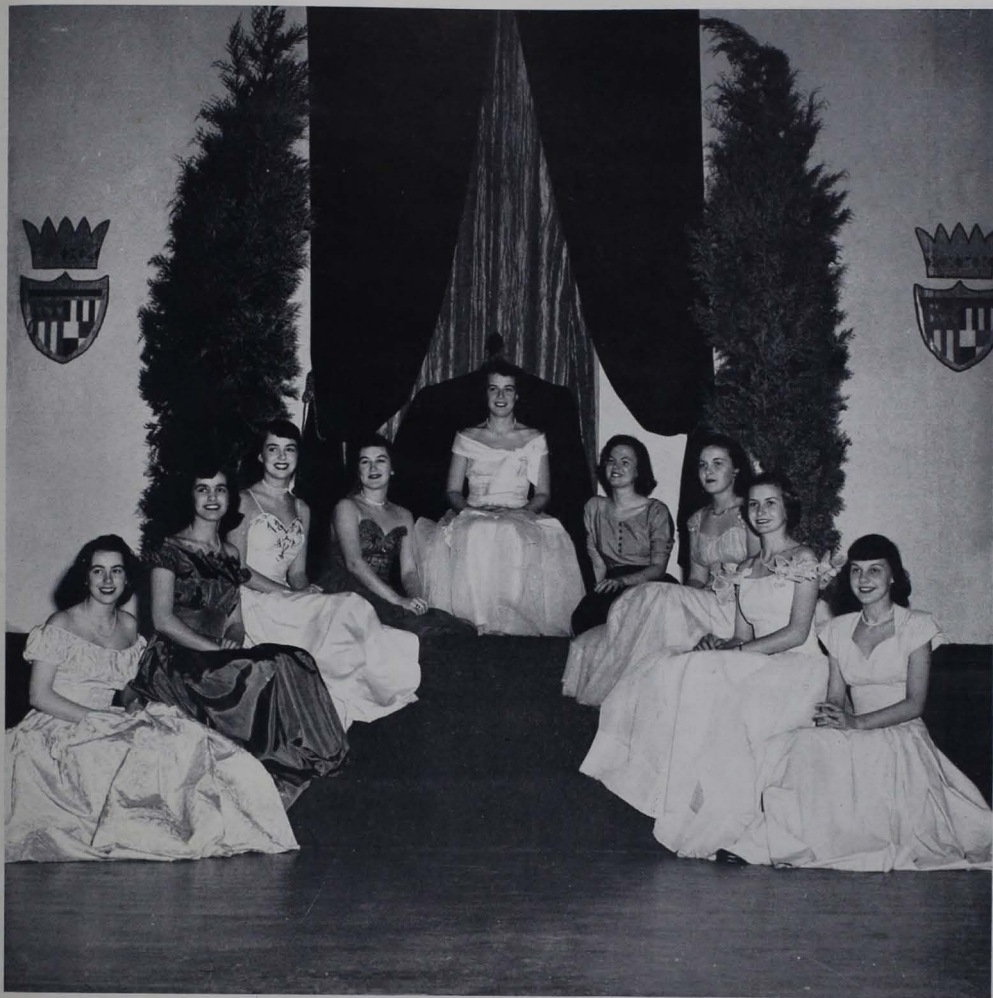
1949 MAY QUEEN AND HER COURT