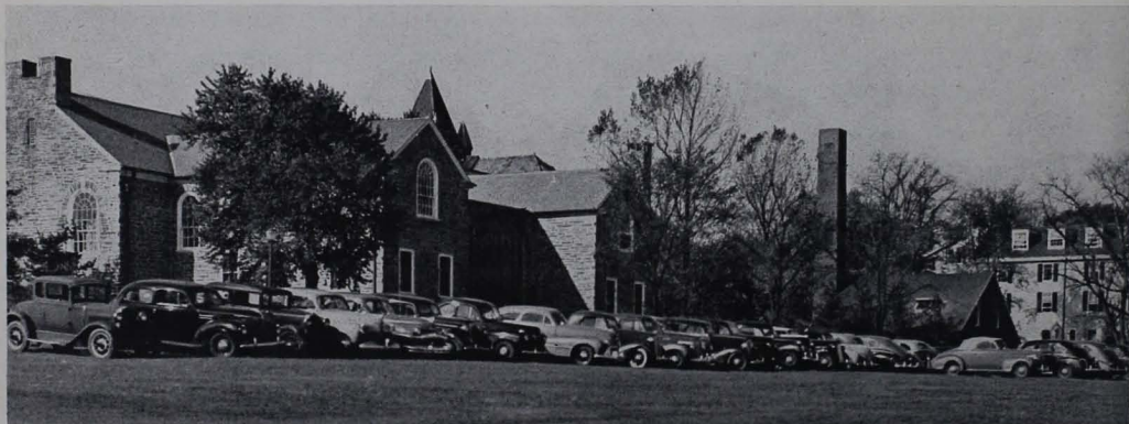
Parked for classes—not a football game!

Finally, there was the problem of instructing this larger student body. To this end the faculty was enlarged, many teachers were given heavier teaching loads than was customary, and classrooms were scheduled for use during a greater part of the day than in the past. And so, by plan or by improvisation, the difficulties of the beginning of this unusual year were met and passed. Met and passed with greater ease than many believed possible on first trying to picture Ursinus College with an enrollment of 895 students.