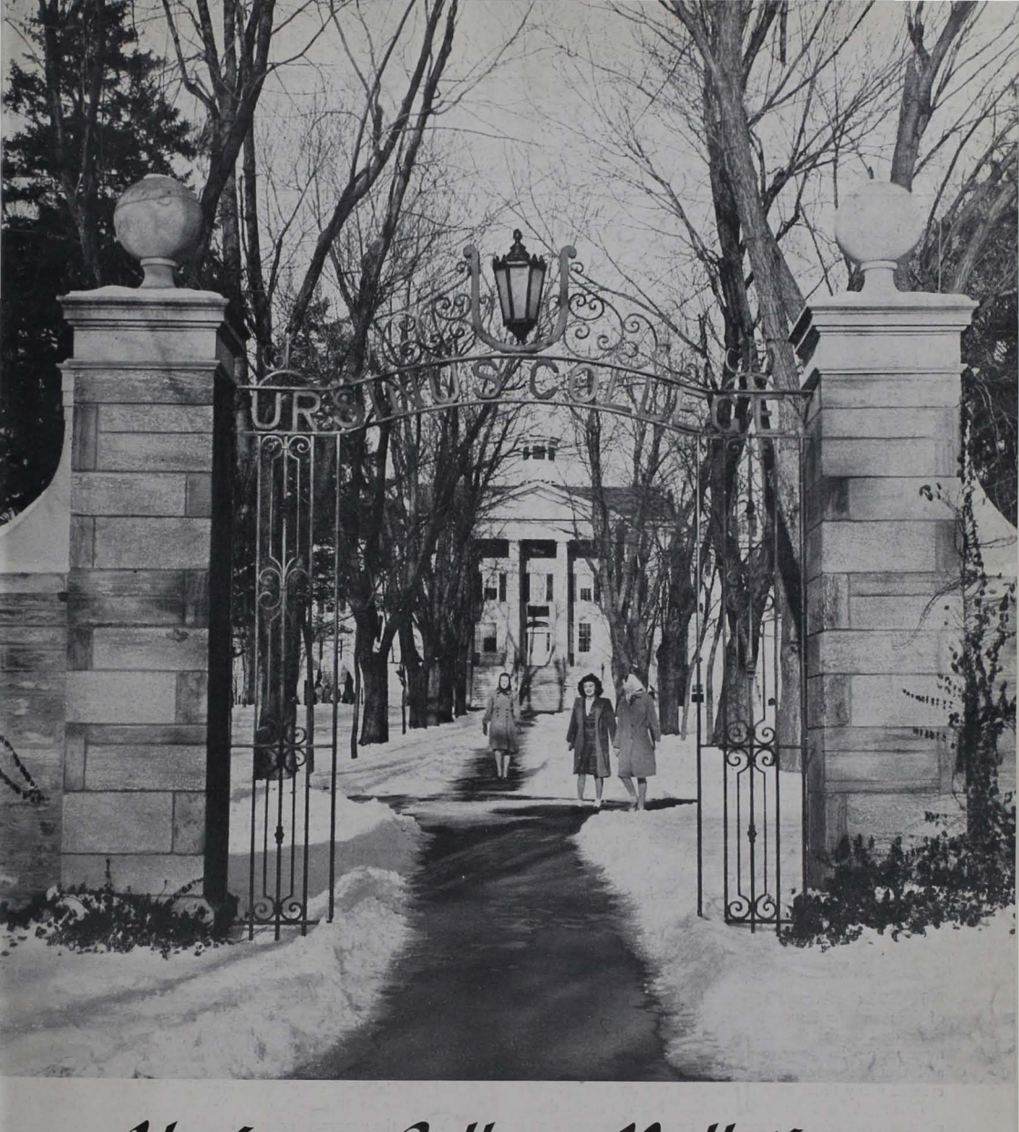
Ursinus College Bulletin Alumni Journal