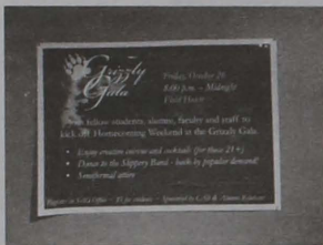
Banners hang in Lower Wismer.

The Floy Lewis Bakes Field House will transition from athletic facility to cocktail party venue for Ursinus' first Grizzly Gala on Friday, Oct. 26 from 8 p.m. to midnight. The Grizzly Gala will be the kick-off of homecoming weekend. "It's a