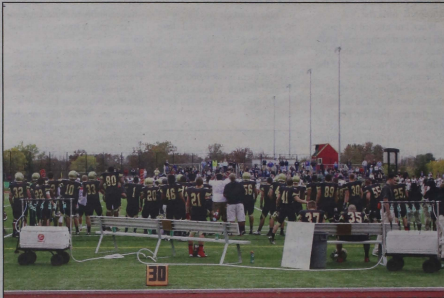
In front of a large homecoming crowd of students, alumni, faculty and staff the Ursinus Bears fell to the Johns Hopkins Blue Jays 35-17 on Saturday, Oct. 27.

The rest of the first quarter became a defensive battle, but then Hopkins came out in the second quarter with a 70-yard rushing touchdown with 11 minutes left in the half. The score put the Blue Jays up 14-3.