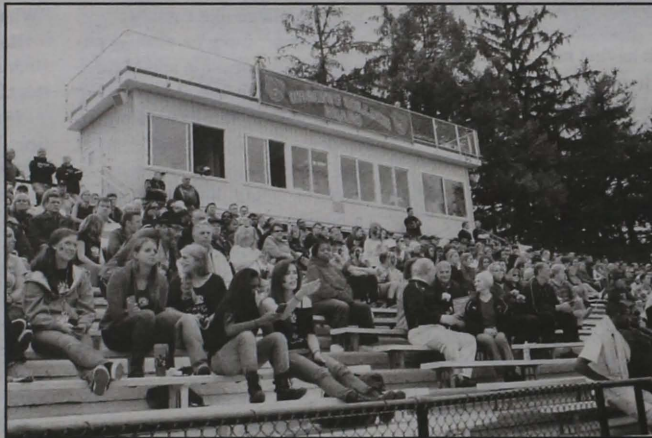
Photo at right, the homecoming crowd of alumni and students rooted on the Bears, who fell to Johns Hopkins, 35-17.